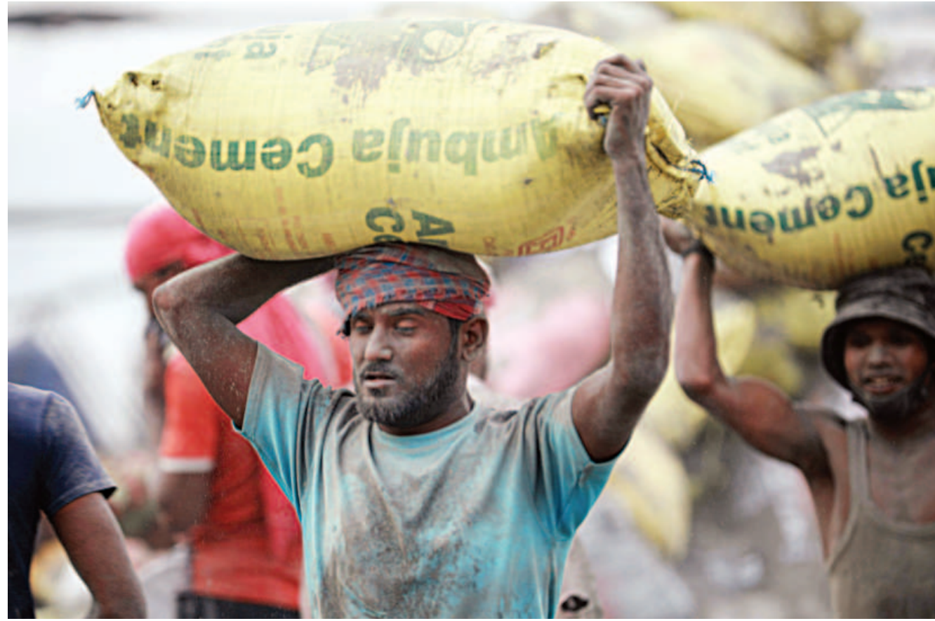
Without any protection, workers unload bags of fly ash from a vessel in Chattogram city's Sadarghat area yesterday. The labourers are not aware of the health risk involved in inhaling fly ash, a key material for making cement. Fly ash inhalation has been linked to respiratory, heart, and kidney diseases.