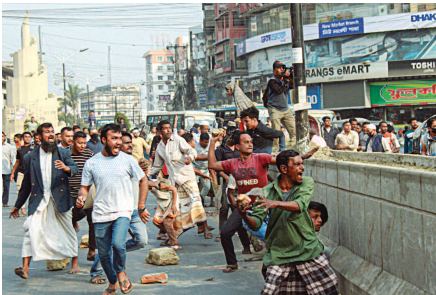
Hawkers throwing brick chunks at police during their clash with the law enforcers after the latter tried to evict them in Chattogram city's New Market area yesterday. At least 10 people, including five policemen, were injured. Story on page 5.