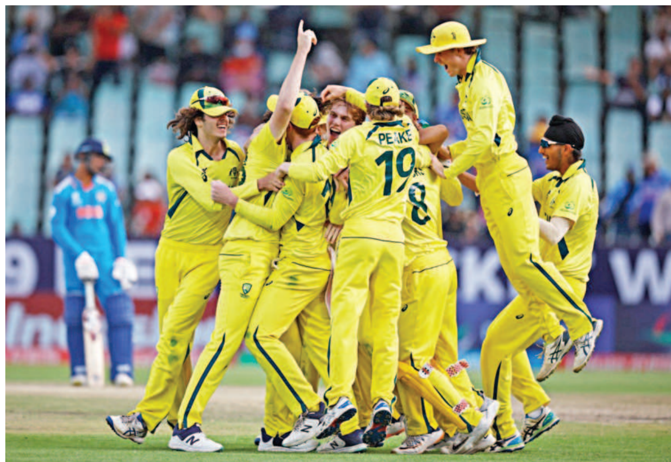
Australia players celebrate the last wicket of India in the final of the ICC Under-19 World Cup at the Willowmoore Park in Benoni yesterday. The Aussies won the match by 79 runs to clinch the title for fourth time.