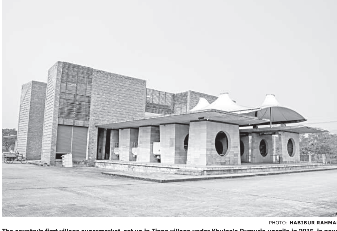
The country's first village supermarket, set up in Tipna village under Khulna's Dumuria upazila in 2015, is now largely unused due to a myriad of factors- including syndicates of brokers, traders, and middlemen.

Fazr Zohr Asr Maghrib Esha AZAN 5-30 12-45 4-15 5-52 7-15 JAMAAT 6-05 1-15 4-30 5-56 7-45