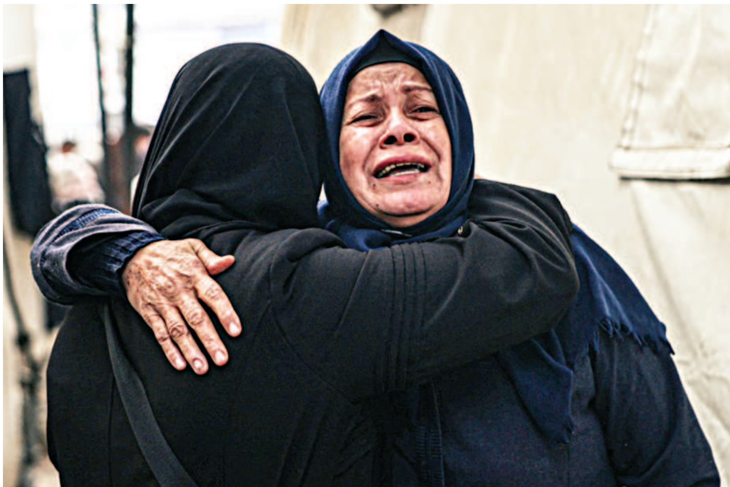
Palestinians mourn after identifying the bodies of relatives killed in overnight Israeli bombardment on the southern Gaza Strip, at Al-Najjar hospital in Rafah yesterday.

The vaccine, known as Qdenga, is produced by Japanese pharmaceutical firm Takeda.