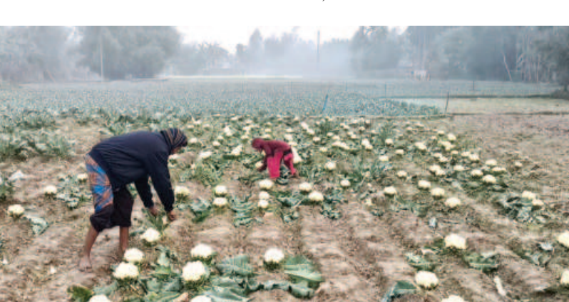
Farmer Shafiqul Islam harvests cauliflowers from his field at Fulgachh village in Lalmonirhat Sadar upazila.

About 33,000 to 34,000 pieces of cauliflower can be cultivated on each hectare, DAE sources said.