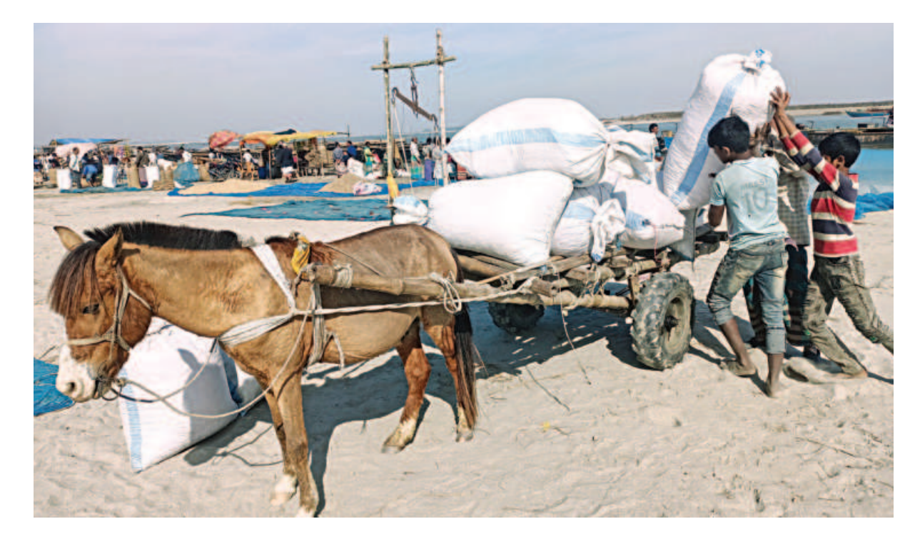
Traders load Ganjia paddy onto a horse-driven cart after purchasing it from farmers at a market in Char Jorgach on the Brahmaputra riverbed.

This is an online tender where only e-Tender will be accepted in the national e-GP portal and no offline/hard copies will be accepted. To submit e-Tender registration in the National e-GP system portal (http://www.eprocure.gov.bd) is required. The fees of downloading the e-Tender Documents from the National e-GP system portal have to be deposited online through any registered banks branches of Bangladesh. Further e-GP information and guidelines are available in the National e-GP system portal and from help desk (helpdesk@eprocure.gov.bd). Ritesh Chakm Jail Super Joypurhat District Jail Phone 02589915588(Office) GD-240 joypurhatjail@gmail.com