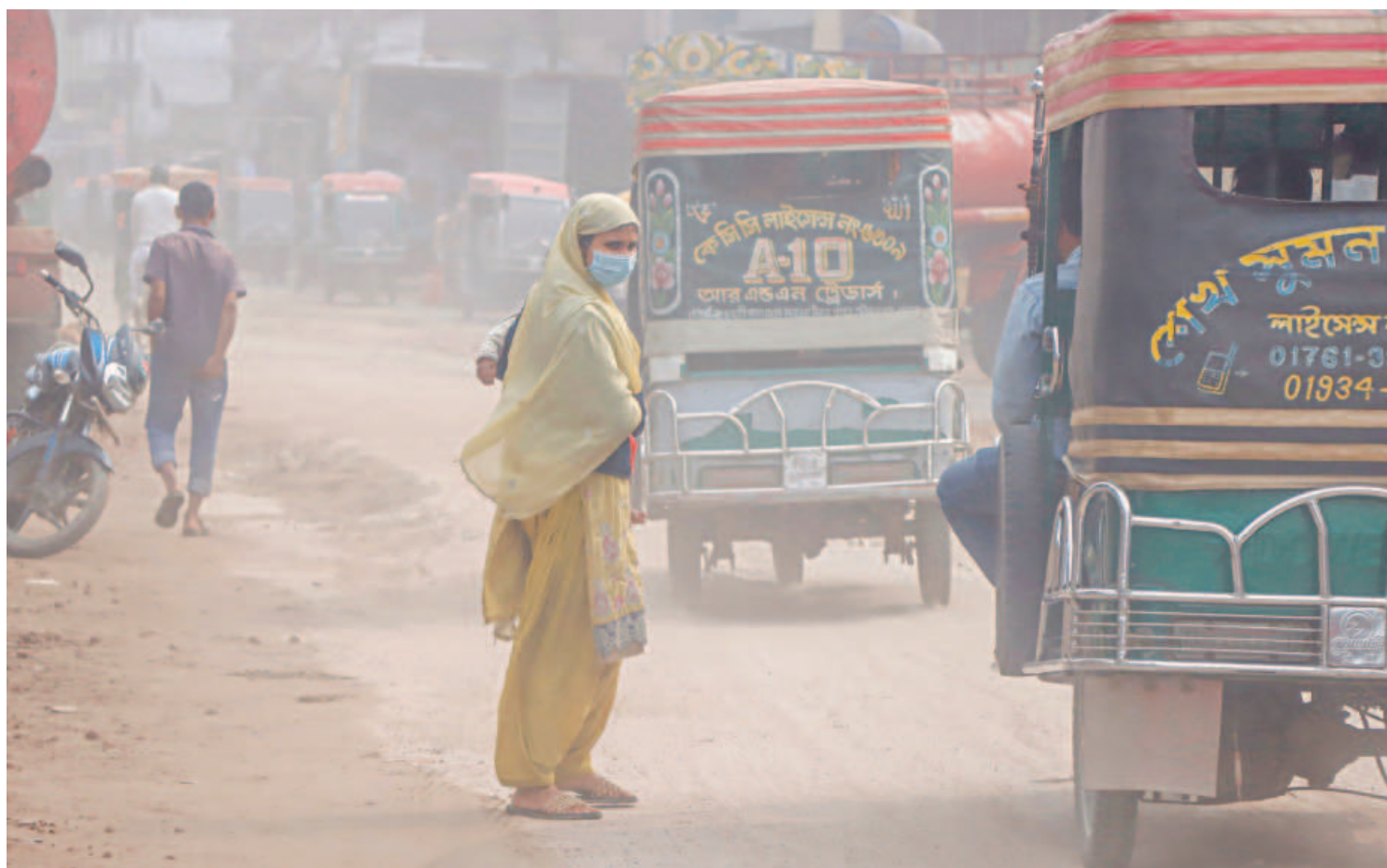
A woman, carrying a child, had to wear a mask while crossing the BIDC road in Khulna's Khalishpur to protect herself from heavy dust pollution yesterday. According to weather reports and the Air Quality Index, Khulna's air was categorised as "unhealthy".