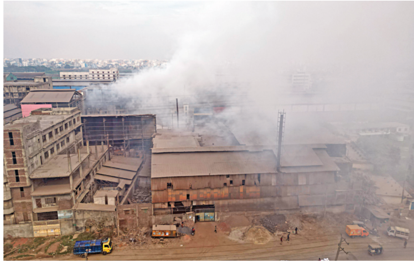
Thick smoke billows from factories at the Shyampur industrial area in Old Dhaka, causing sufferings to locals, particularly the elderly and children. The High Court on Tuesday ordered the government to set up an air quality alert system to warn people about unhealthy pollution levels. Dhaka persistently ranks high on the list of cities worldwide with the worst air quality, coming in at number four yesterday morning.

Earlier on February 1, the government ordered one