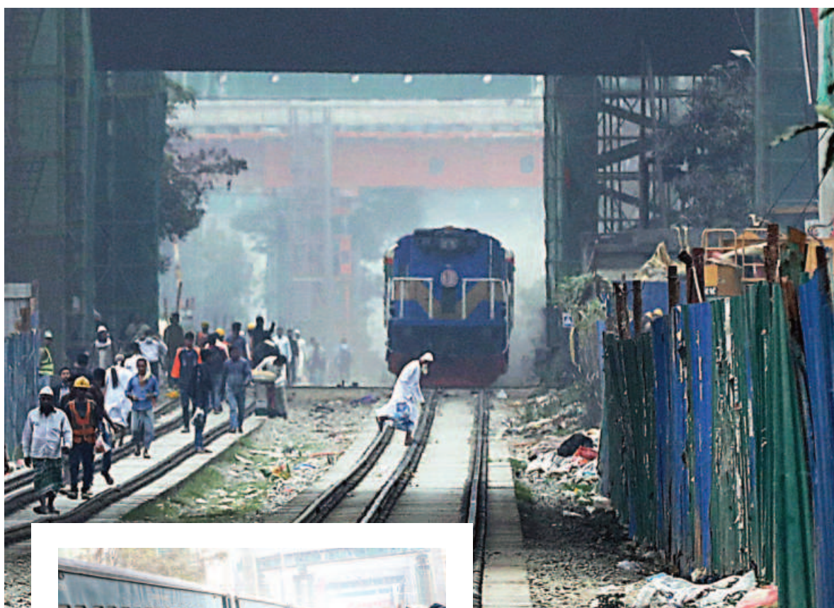
It is a recurring sight. Pedestrians and motorcyclists disregarding approaching trains. They often put their lives and those of others around them in danger as their need to hurry along outweighs their concern for safety. The photos were taken recently from the Moghbazar level crossing in the capital.