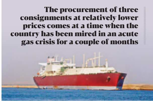
The procurement of three consignments at relatively lower prices comes at a time when the country has been mired in an acute gas crisis for a couple of months

LNG cargo for $9.93 per MMBtu. This was the first time since the Ukraine war started in February 2022 that the government was able to purchase an LNG cargo for less than $10 per MMBtu.