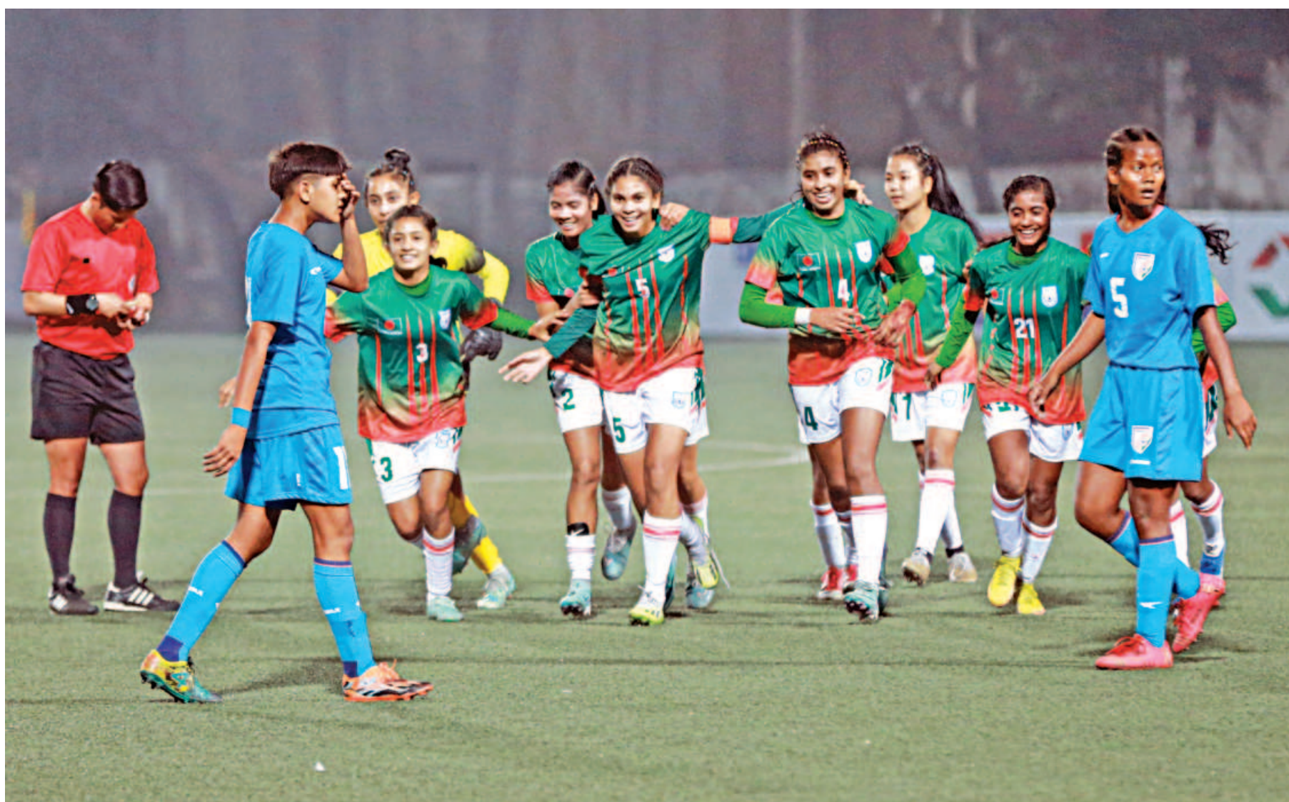
Bangladesh players celebrate their 1-0 win over India, which took them to the final of the SAFF U-19 Women's Championship, at the Birshreshtho Mostafa Kamal Stadium in Kamalapur yesterday. Story on page 11.

However, UPDF, in a press release, claimed that SEE PAGE 6 COL 4