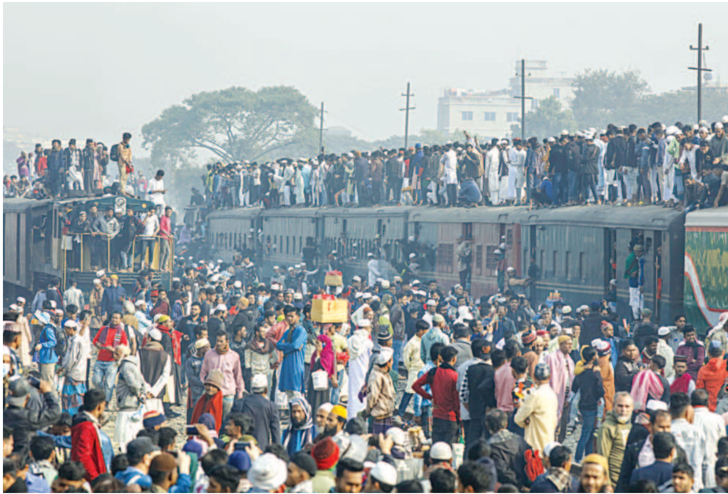
Many people risked their lives by occupying almost every inch of the train roof and even the coupler at the front of the locomotive, as they left Tongi after the first phase of the 57th Biswa Ijtema ended yesterday. The photo was taken near Tongi Rail Station.

As part of the rationalised traffic system SEE PAGE 6 COL 4