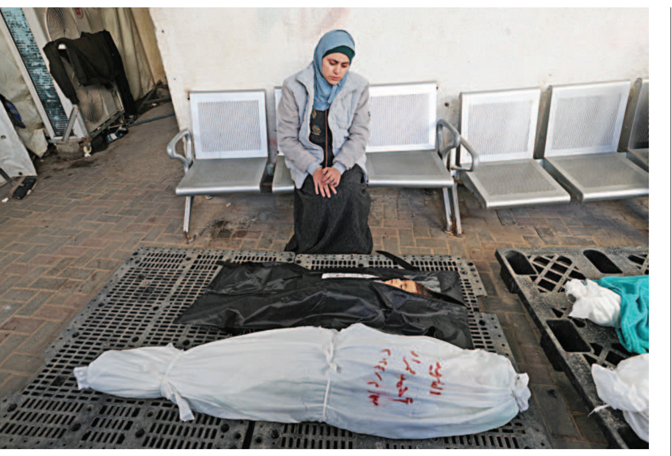
A relative mourns next to the bodies of two Palestinian children killed in Israeli strikes in Rafah, in the southern Gaza Strip yesterday.

Pakistani internet freedom watchdog Bytes 4 All recorded four hours-long social media shutdowns in January -- cutting off access to TikTok, Facebook, Instagram and