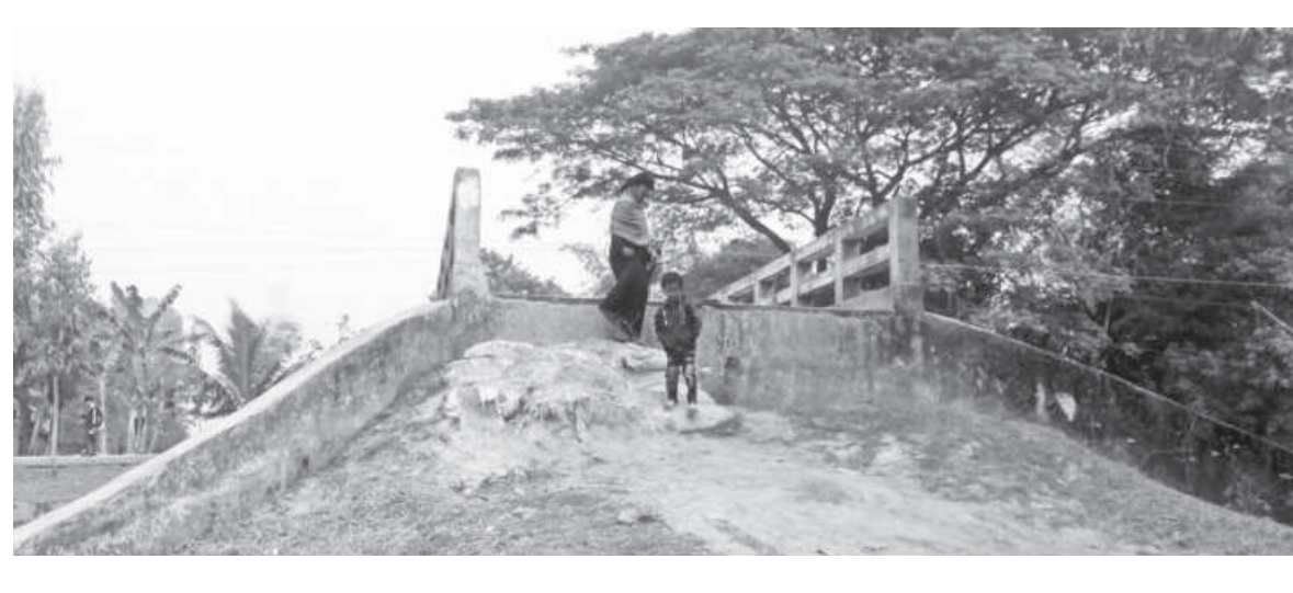
For over eight years, residents of Kadamtara at Habiganj's Bhagulipara continue to suffer as an eight-metrelong bridge over the Dhulia canal remains inaccessible due to the absence of approach roads.

rate of 1.44 percent. Due to a sudden rise in infection rate from the beginning January, the government has decided to administer Covid-19 vaccines again.