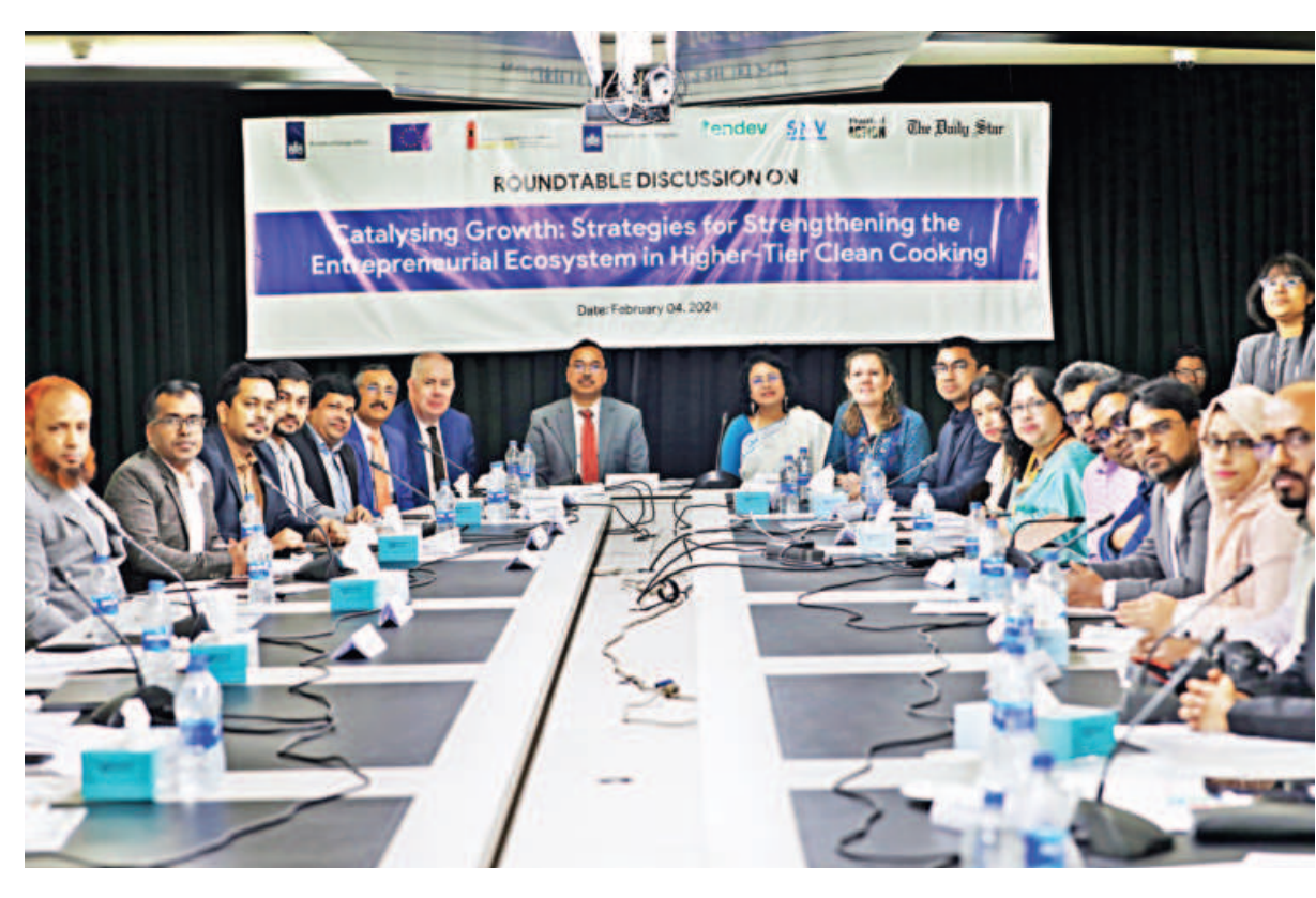
Speakers at a roundtable on "Catalysing Growth: Strategies for Strengthening the Entrepreneurial Ecosystem in Higher-Tier Clean Cooking" yesterday. The Daily Star organised the event in association with Practical Action and SNV Bangladesh at The Daily Star Centre.