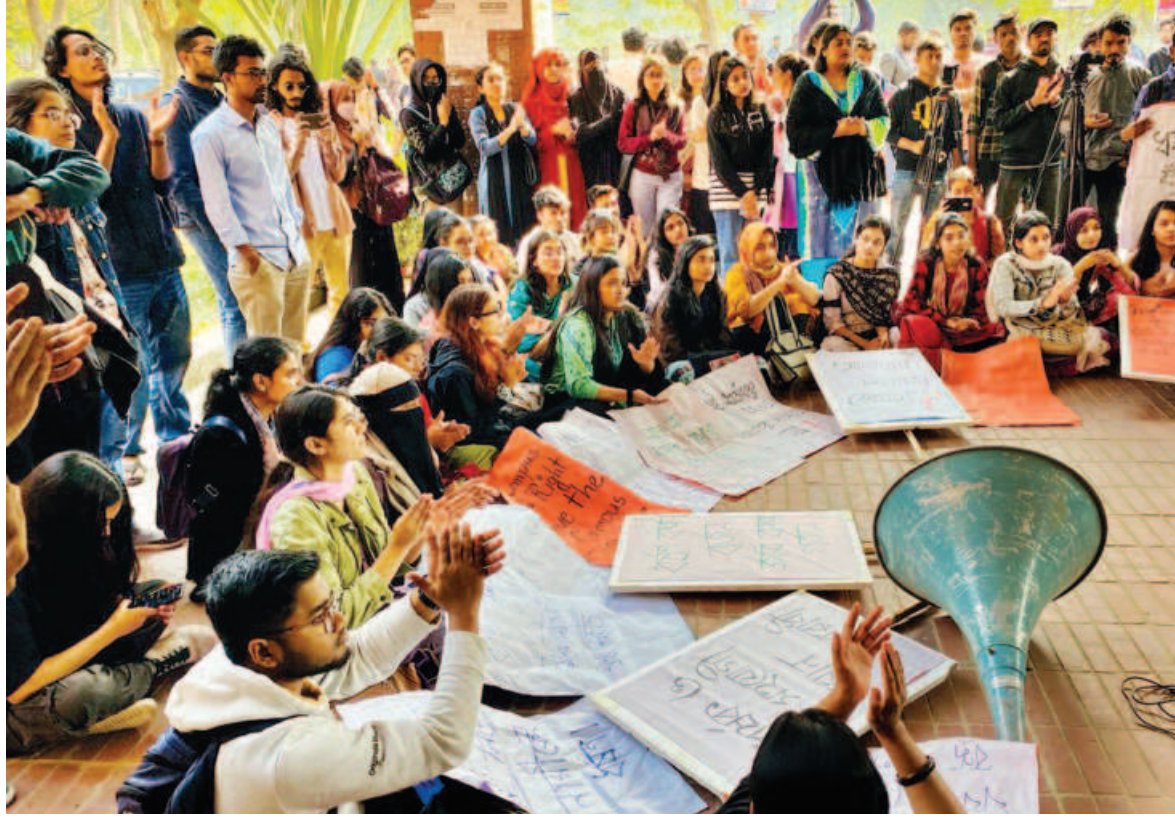
Teachers and students of Jahangirnagar University stage a protest in front of the Registrar Building yesterday, demanding punishment of those involved in the rape of a woman on the campus Saturday night.

Many of the men were still in their huts in the area because they were reluctant to leave their farm animals and other belongings.