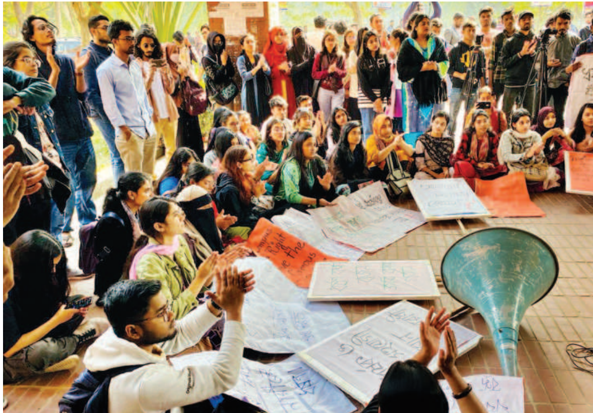
Teachers and students of Jahangirnagar University stage a protest in front of the Registrar Building yesterday, demanding punishment of those involved in the rape of a woman on the campus Saturday night.

SEE PAGE 2 COL 1 ANALYSIS BY SHAHAB ENAM KHAN ON PAGE 2