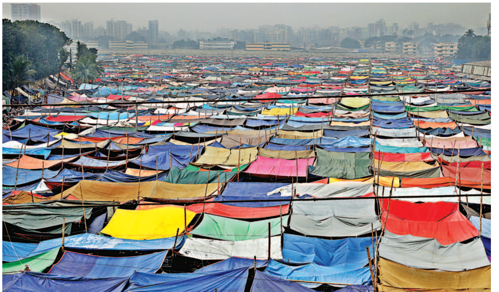
Colourful sheets cover the Ijtema ground in Tongi, Gazipur, as hundreds of thousands of Muslim devotees gather for the religious congregation. The first phase of the 57th Biswa Ijtema on the Turag began on Friday after the Fazr prayers and it will conclude with the Akheri Munajat (final prayers) today.