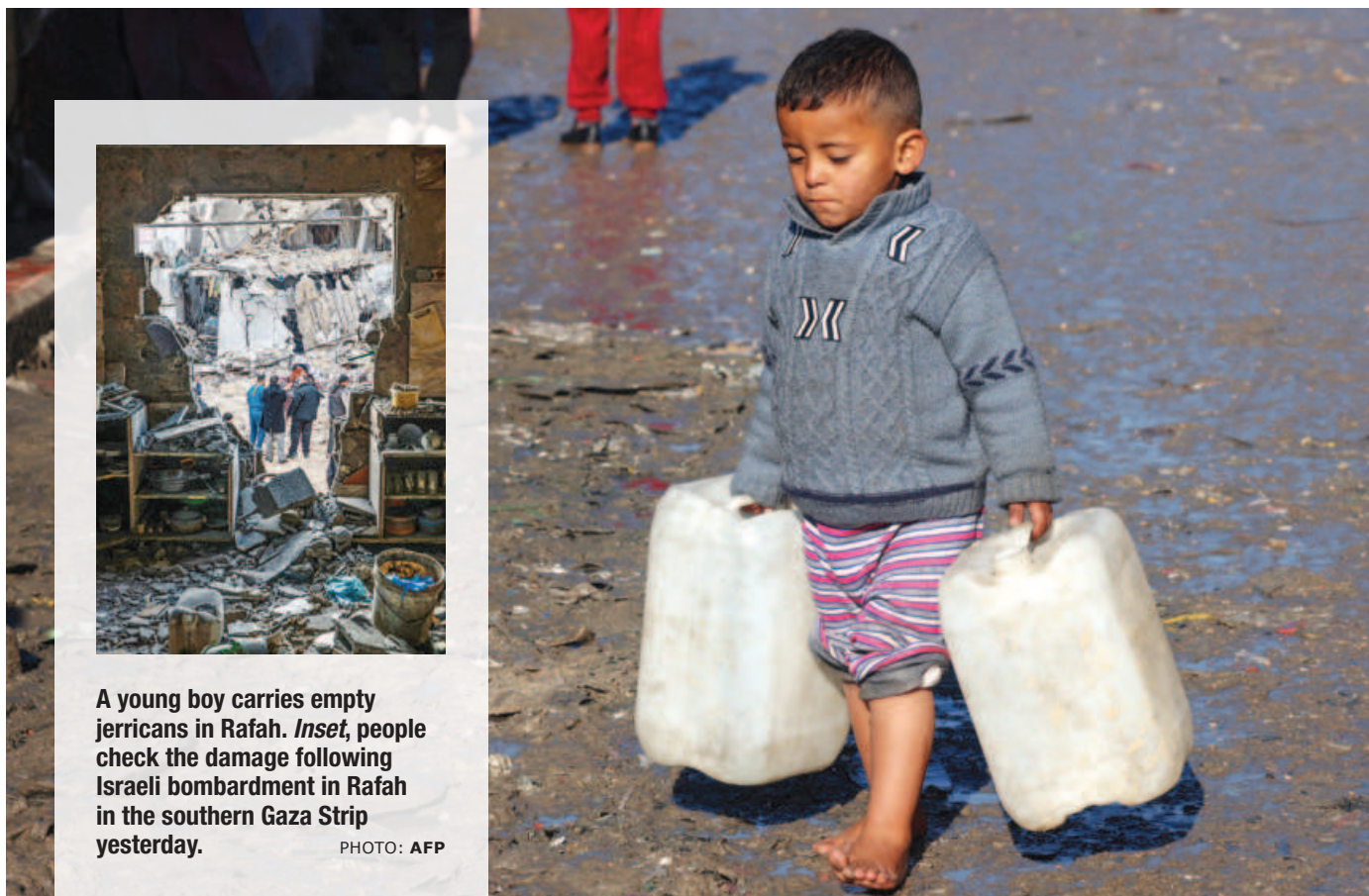
A young boy carries empty jerrycans in Rafah. Inset, people check the damage following Israeli bombardment in Rafah in the southern Gaza Strip yesterday.

The US Court of Appeals for the District of Columbia Circuit heard arguments on Trump's immunity claim on January 9, but has not yet issued its ruling.