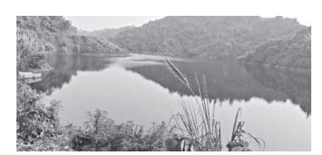
A lake was created for fish farming inside the forest by building a dam. The Forest Department in a drive yesterday recovered the land.

"If vou (BNP-Jamaat) want to do terrorism, want to destroy the achievements of Bangladesh, then I want to tell you, the law will run its course. The law will be strictly implemented to deal with it," the minister