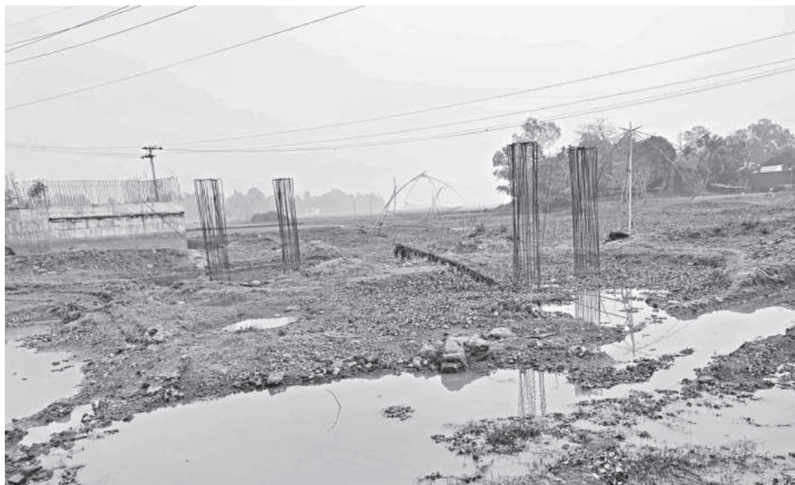
The Khakuriya bridge was supposed to be completed about 2 years ago under a Tk 4.21 crore project. However, the structure remains incomplete, hindering communication across 40 villages in Tangail's Ghatail upazila.

রেডি ফ্ল্যাট বিক্রয় SAVAR DOHS ক্যান্টনমেন্ট এলাকায় ১০০০ বর্গফুটের সম্পূর্ণ রেডি ফ্ল্যাট প্রতি বর্গফুট ৮৫০০/- দরে ১,১৫,০০,০০০/- টাকায় ফ্ল্যাট ফিন্যান্সিং কার্যক্রম জমা মাত্র ৫০০০ টাকা দরে ৭৫,০০,০০০/- টাকায় ১টি ফ্ল্যাট বিক্রয় হইবে। যোগাযোগ: ০১৭১৫০৪৪৪৮, ০২৮০৯১১৪২