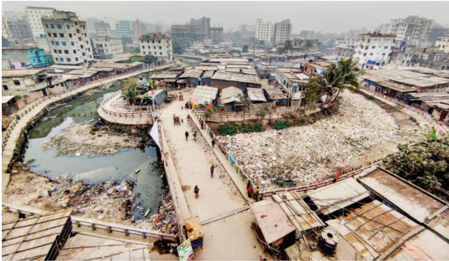
CLOGGED BEYOND RECOGNITION... Once a vital drainage channel, the Ramchandrapur canal in Mohammadpur now resembles a landfill. Neglect and rampant dumping have turned the waterway into a source of misery for residents facing waterlogging, health risks, and an unbearable stench. The photo was taken recently.