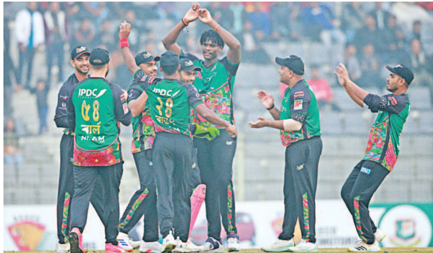
Sylhet Strikers players celebrate their 15-run win over Durdanto Dhaka in a Bangladesh Premier League fixture in Sylhet yesterday. The victory put an end to Sylhet's five-match losing streak. A few changes appeared to have worked for Sylhet, who put on a different coloured kit and had its players' names and numbers printed in Bangla to mark the month of February -- a month when the sacrifices made by the martyrs of the Language Movement are remembered. Meanwhile, in the second game of the day, Chattogram Challengers were bundled out for 72 in 16.3 overs, the lowest total in BPL so far, as Comilla Victorians romped to a seven-wicket victory.

Both defending champions India and Pakistan are