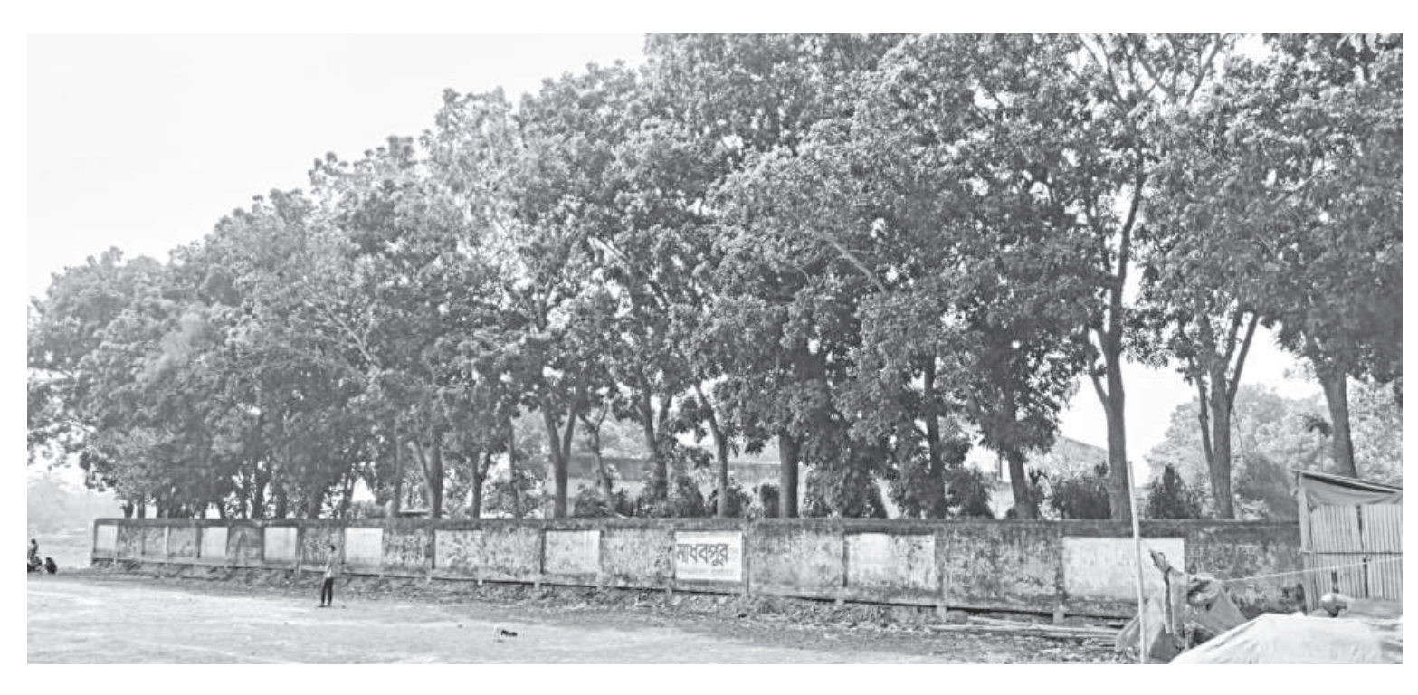
According to the Habigani municipal office, 108 trees have been selected to be felled, including 70 in front of the district Shilpakala Academy and 38 in front of Biam Laboratory School. Most of the trees are between 20 and 25 years old.