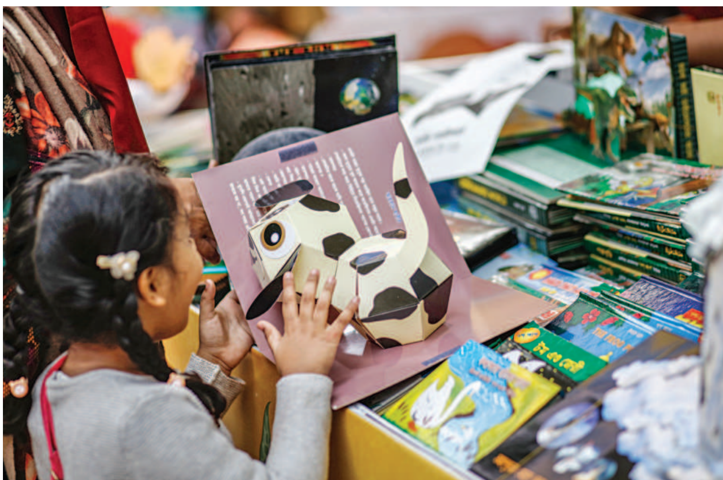
JOY OF READING...A little girl is delighted as she discovers for the first time a pop-up book for children while exploring the stalls at the Children's Square of the Amar Ekushey Boi Mela near the Ramna Kali Mandir gate yesterday afternoon during the "Shishu Prohor" or children's hours.