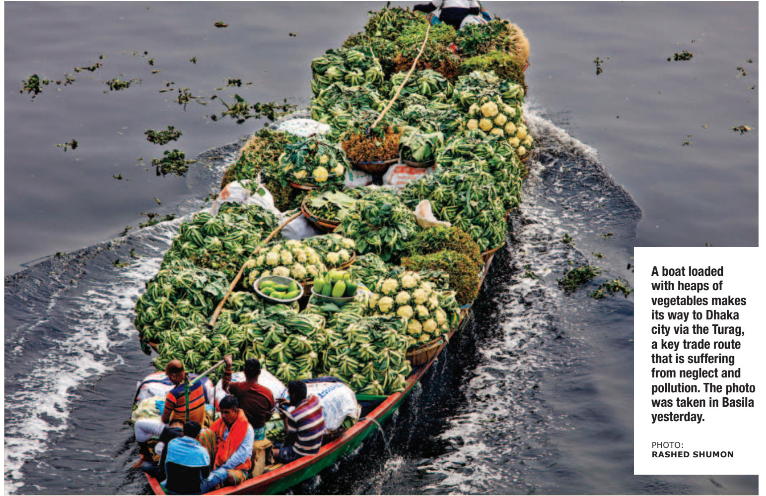
A boat loaded with heaps of vegetables makes its way to Dhaka city via the Turag, a key trade route that is suffering from neglect and pollution. The photo was taken in Basila yesterday.