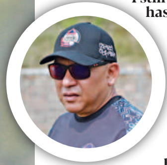
KHALED MAHMUD SUJON, BCB director

“ I always say that Mahmudullah [Riyad] is good enough to play all three formats. It really hurts me that he doesn't play Tests. I still can't accept that he has retired [from Tests]. I still think that he has the ability to play Tests. Bangladesh needs an experienced cricketer like him. Maybe it is his age which is why he has shifted his focus to white-ball cricket. However, given his experience and the fact that he is in rhythm, I don't think any player can challenge him for his place.