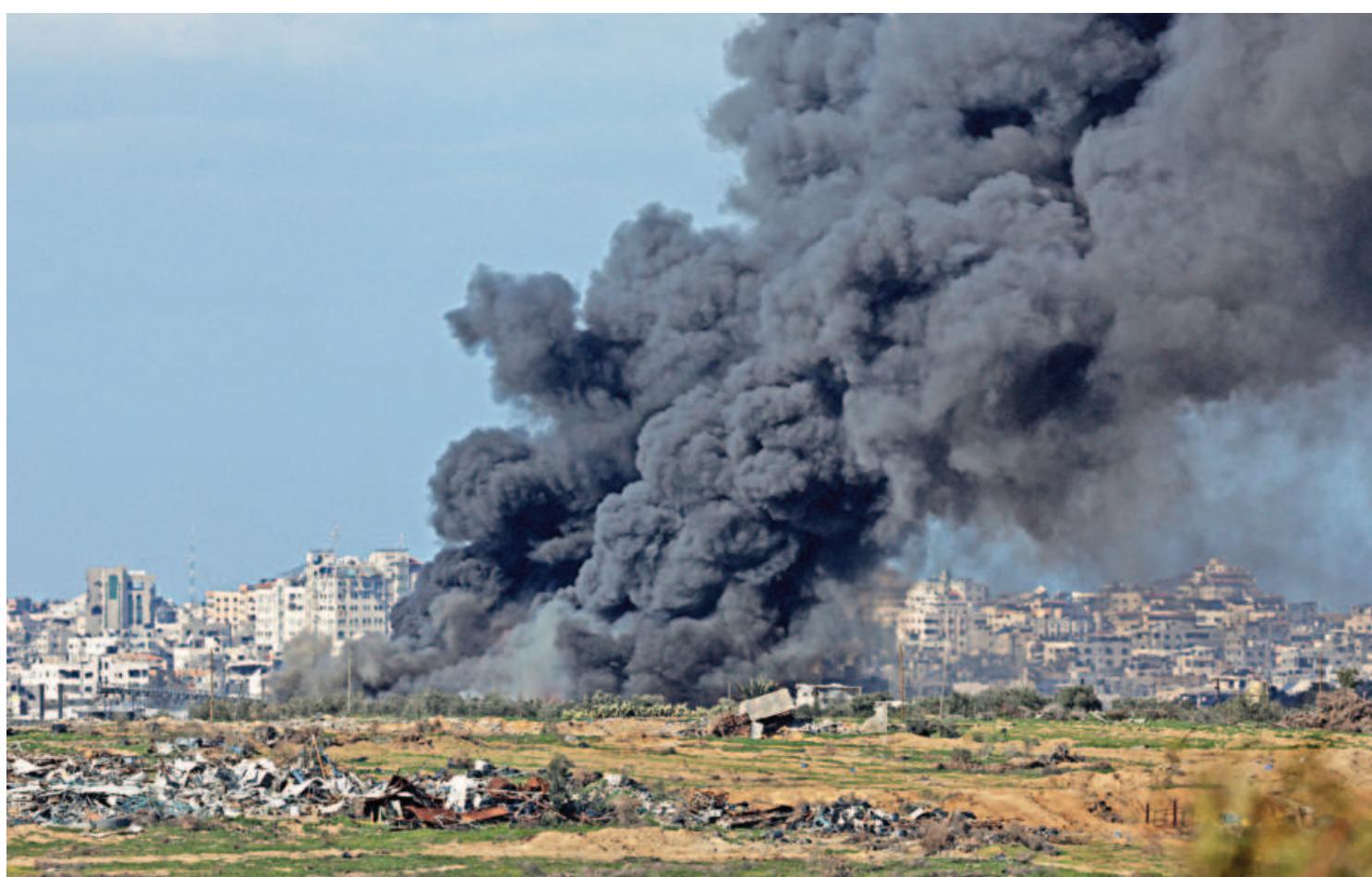
A smoke rises from the North Gaza, amid Israel's offensive in the Palestinian enclave, as seen from Israel yesterday.