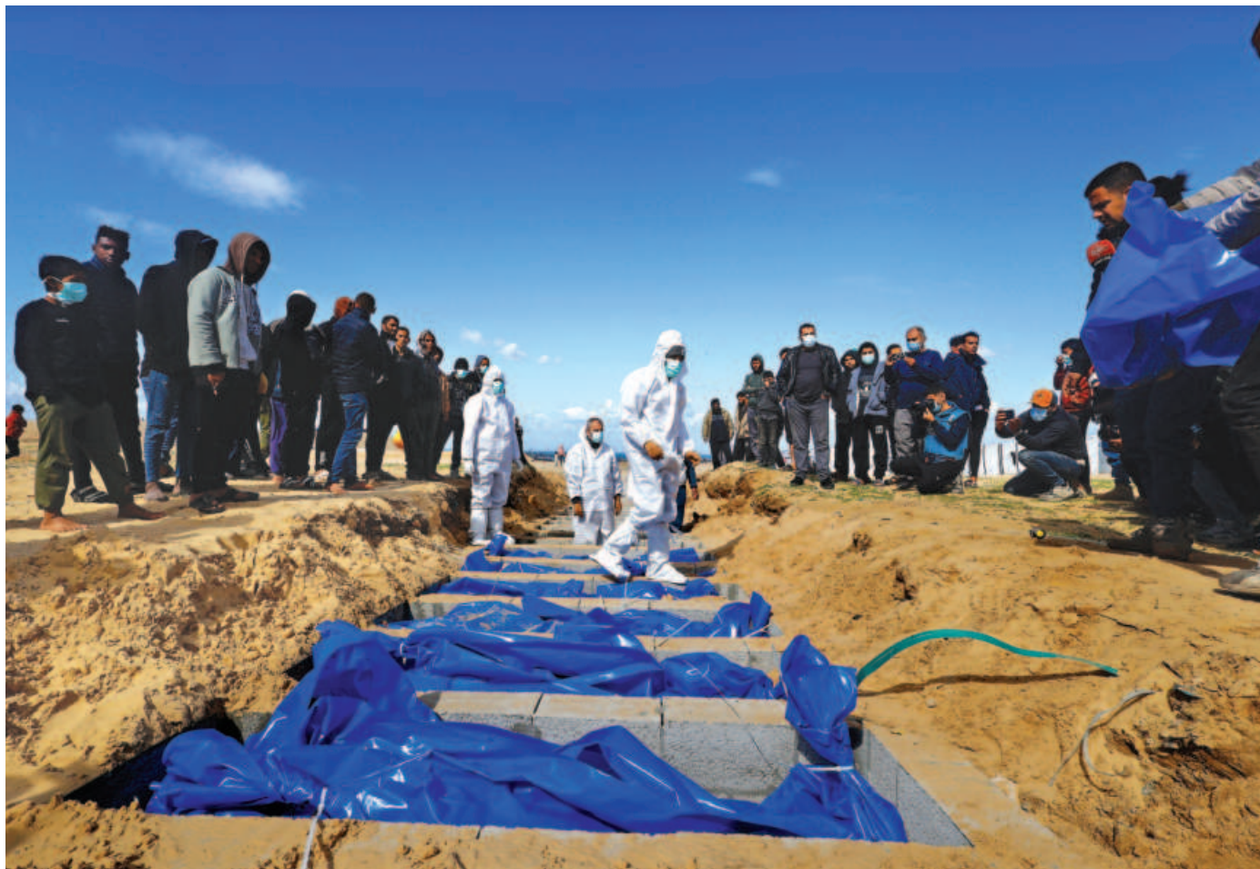
Palestinians bury the dead at a mass grave in Rafah, in the southern Gaza Strip yesterday. They were killed in Israeli strikes and Israel handed the bodies over, according to the Palestinian health ministry officials.