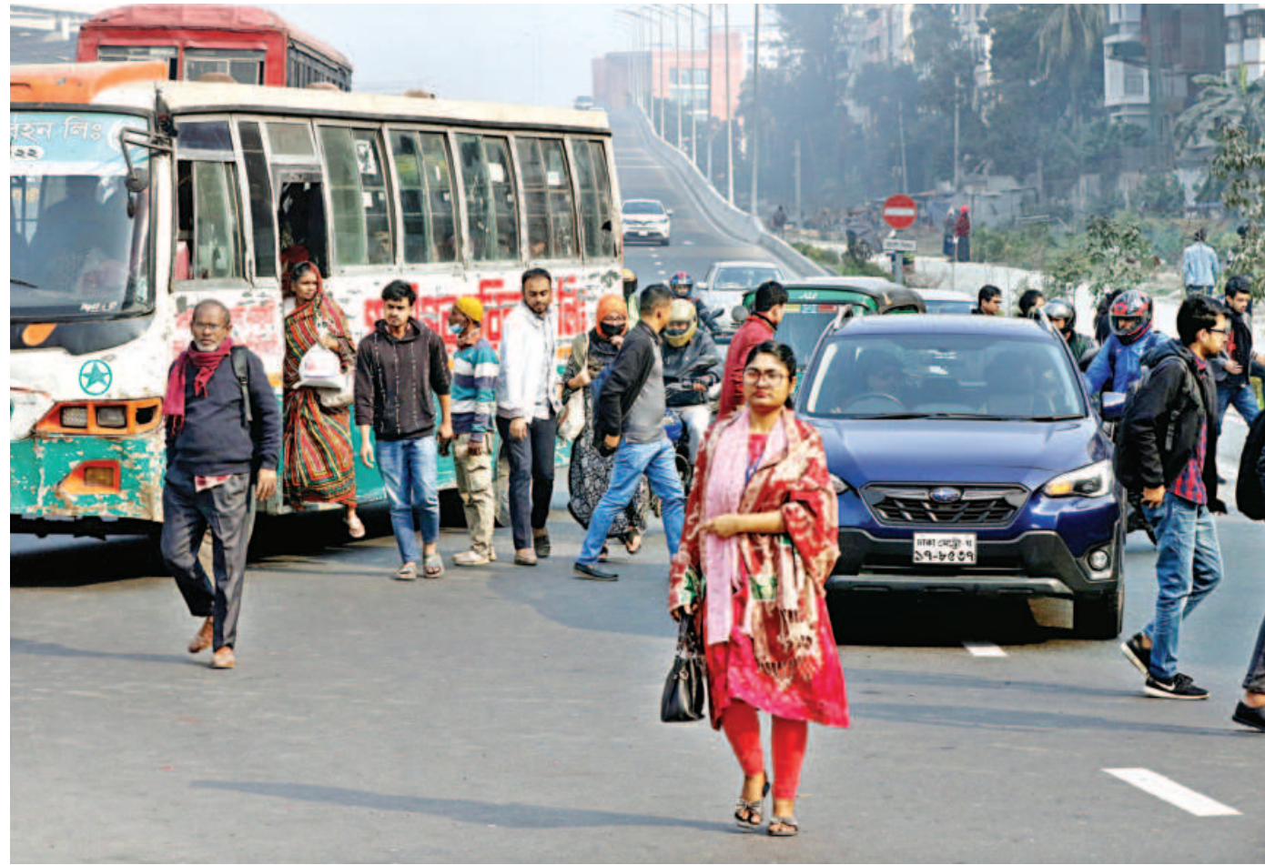
A bus drops off passengers on a ramp of the Dhaka Elevated Expressway in Kakoli intersection area yesterday, obstructing traffic and putting the lives of pedestrians and people in other vehicles at risk.