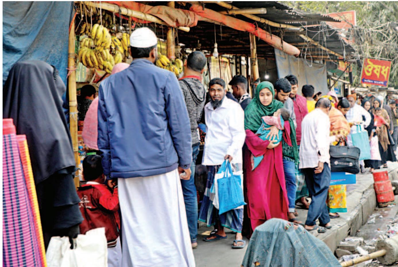
Makeshift shops have been set up on the pavement in front of Bangladesh Shishu Hospital and Institute in Dhaka's Sher-e-Bangla Nagar, causing difficulties for pedestrians and patients. Many are forced to risk walking on the street. The photo was taken yesterday afternoon.