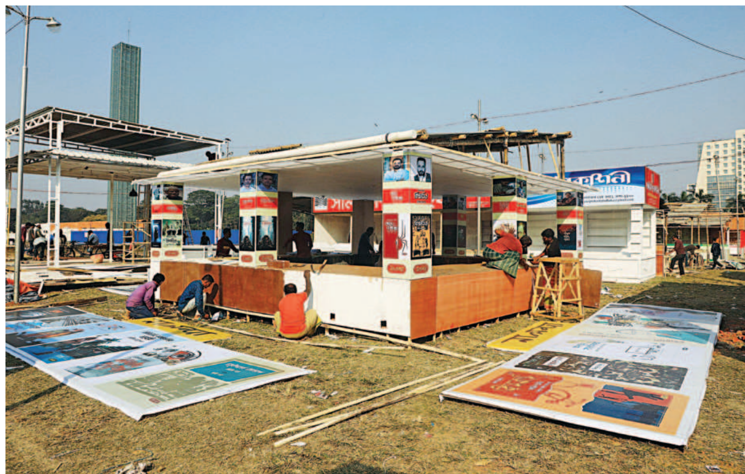
Last-minute work on stalls is underway at the Amar Ekushey Boi Mela at the Suhrawardy Udyan yesterday. The month-long fair sets off on Bangla Academy premises and Suhrawardy Udyan on Thursday.