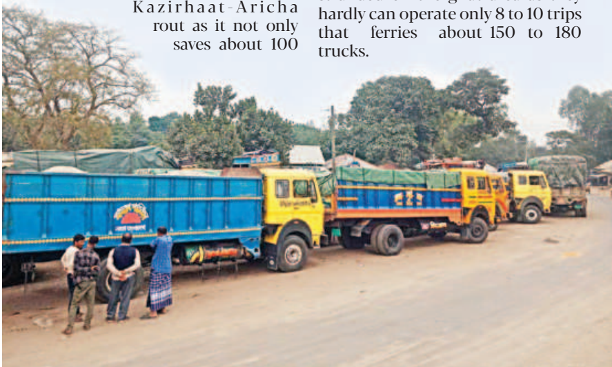
Hundreds of vehicles, many of them goods-laden, waiting to cross the Jamuna river at Kazirhaat ferry terminal in Pabna's Bera upazila.

It was the first time since the country adopted a new hybrid constitution in 2008 — with a president as the chief executive — that presidential nominees have been challenged.