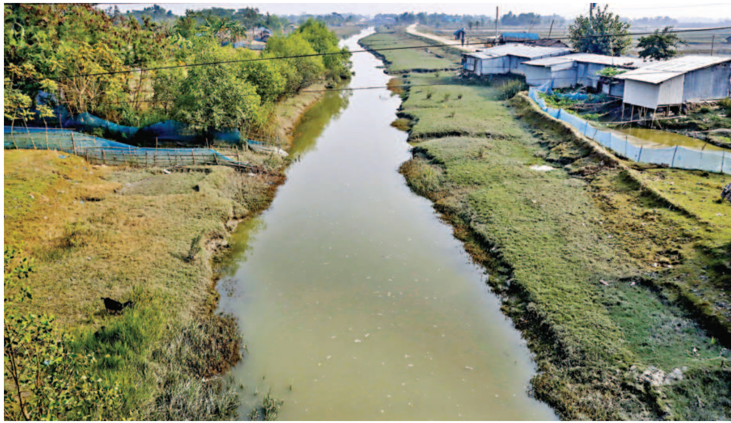
Illegal encroachment and the accumulation of silt have reduced the Belai river in Bagerhat's Rampal upazila into a narrow channel. Locals said the river once used to be wide enough for trawlers and even larger water transport to pass through. However, now due to its shrinking and the Khulna-Mongla rail bridge (not in picture) hanging too low, no such transport can take to the water anymore. The photo was taken from the Belai bridge in the upazila recently.

He sold the carrots for Tk 13 per kg, papayas for Tk 17 a kg, coriander for Tk 25 a kg and radishes for Tk 12 kg to a middleman at Chiding Char in Manikganj's Singair upazila. Monir made a profit of Tk 1.38 lakh against his investment of Tk 3 lakh for harvesting the winter crops.