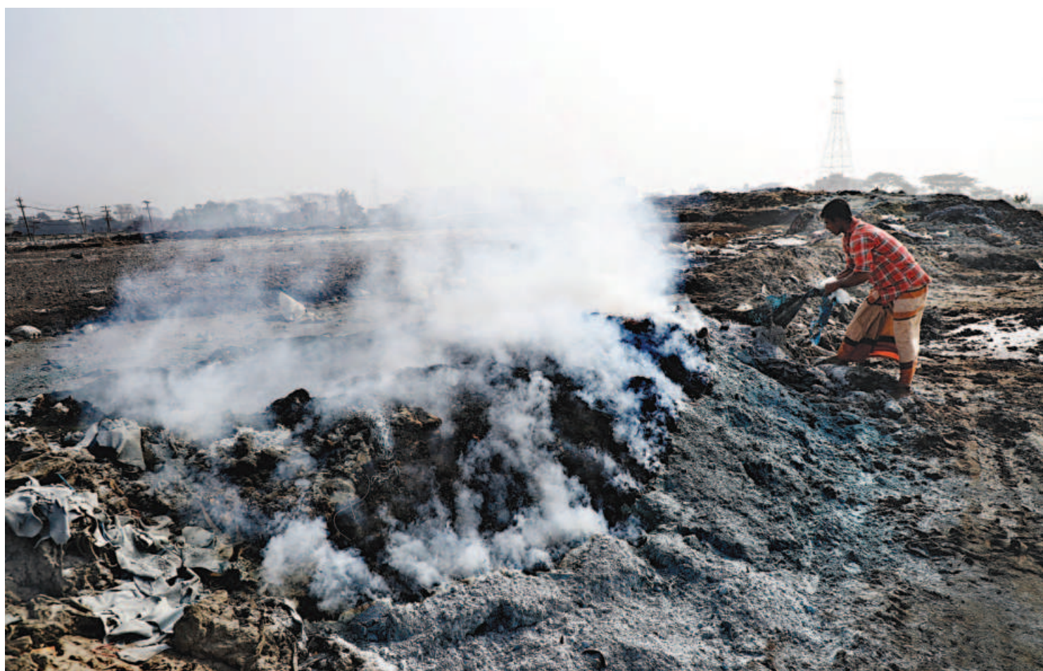
Solid waste, mostly bits of scrap leather, being burned right outside the Savar Tannery Industrial Estate. Dumping of chemically treated waste harms the soil and burning the waste pollutes the air. The photo was taken recently.