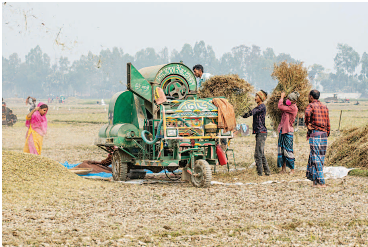
Farmers of Bogura's Dhunat upazila using a thresher to separate mustard seeds from the recently harvested plants. Once all the mustard crops are threshed, the field will be prepared for Boro farming as its season nears. The photo was taken recently.