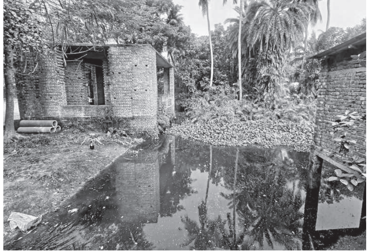
Due to encroachment and pollution, Gulatola canal in Khulna's Dumuria upazila is struggling to survive.

Fazr Zohr Asr Maghrib Esha AZAN 5-35 12-45 4-15 5-46 7-15 JAMAAT 6-10 1-15 4-30 5-50 7-45 SOURCE: ISLAMIC FOUNDATION