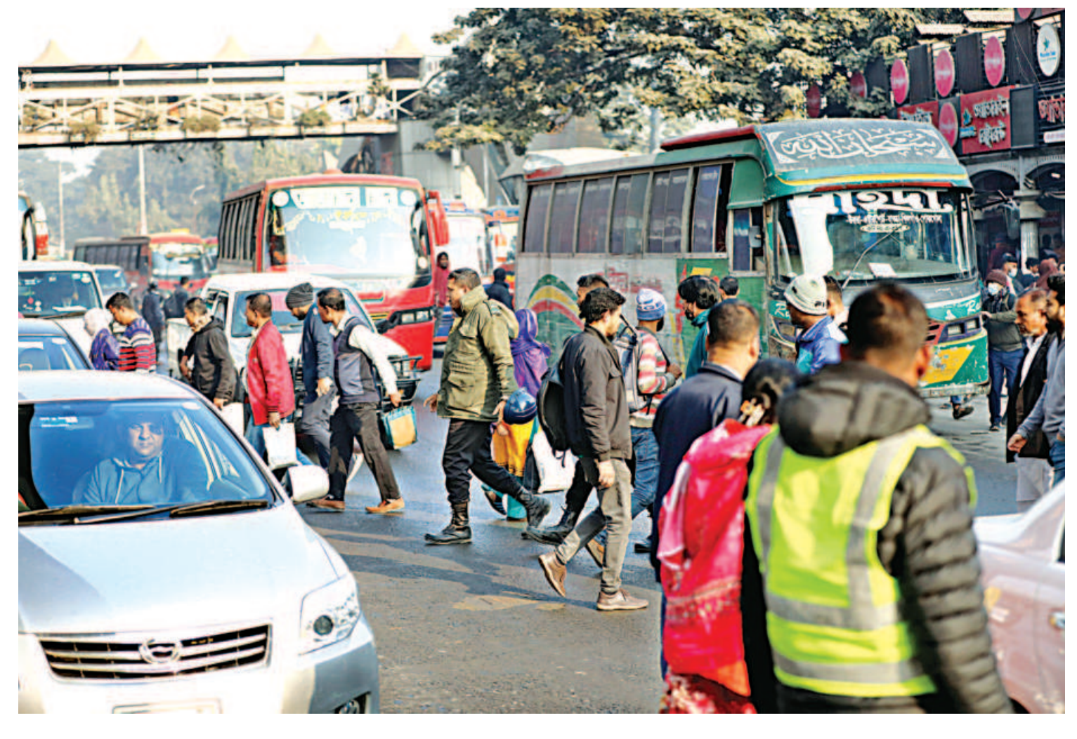
People crossing the busy road near Hazrat Shahjala International Airport without using the footbridge just a few feet away. Such ignorant behaviour by pedestrians often results in road accidents. The photo was taken yesterday.