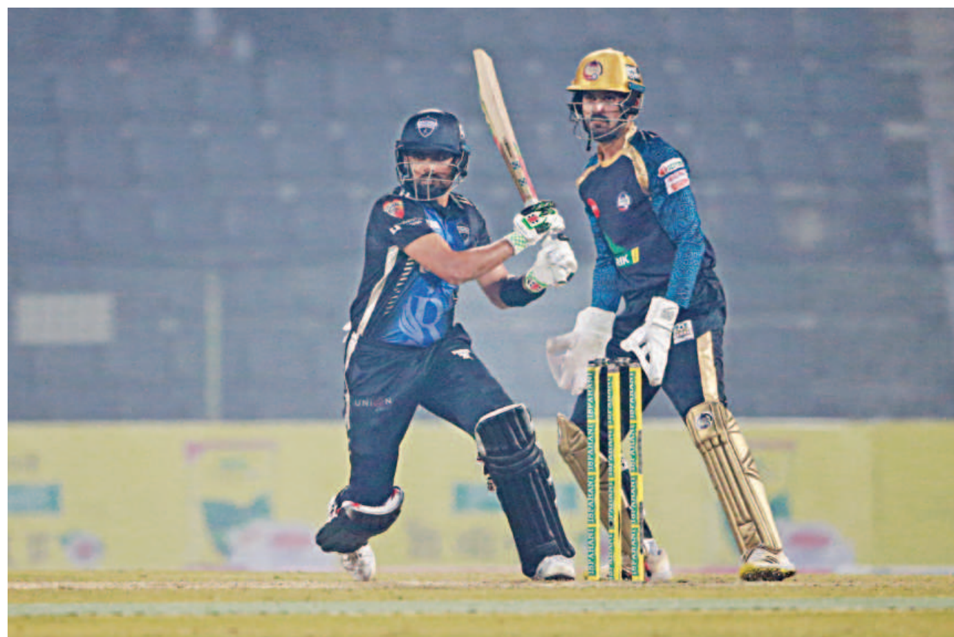
Rangpur Riders' Pakistani batter Babar Azam pulls one during his 46-ball 62 -- a second half-century in three games -- against Durdanto Dhaka in their Bangladesh Premier League fixture at the Sylhet International Cricket Stadium yesterday. Rangpur won the match by 79 runs.