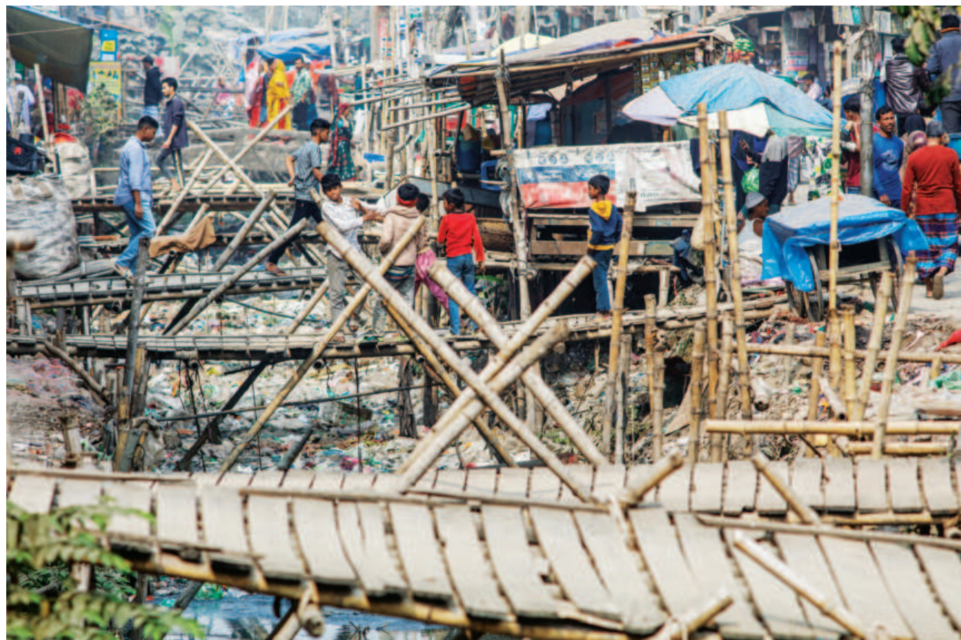
Locals in the capital's Jatrabari have built wooden and bamboo bridges in close proximity to each other over Kajla Khal, a canal that serves as a drainage system for the area. Residents of the nearby neighbourhoods often experience water logging in monsoon because the canal remains partially clogged.