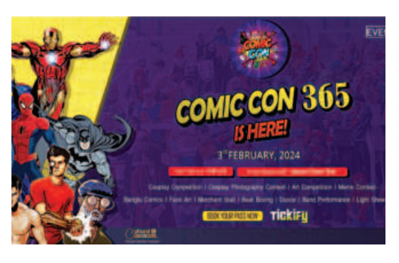
Comic Con 365 February 3 I 11am-11:30pm Jamuna Future Park

January 27 I 10:30am Ekshoek, H-12, Rd-101, Gulshan