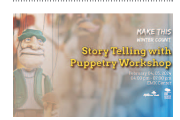
Storytelling with Puppetry Workshop February 4 I 4pm-7pm EMK Centre