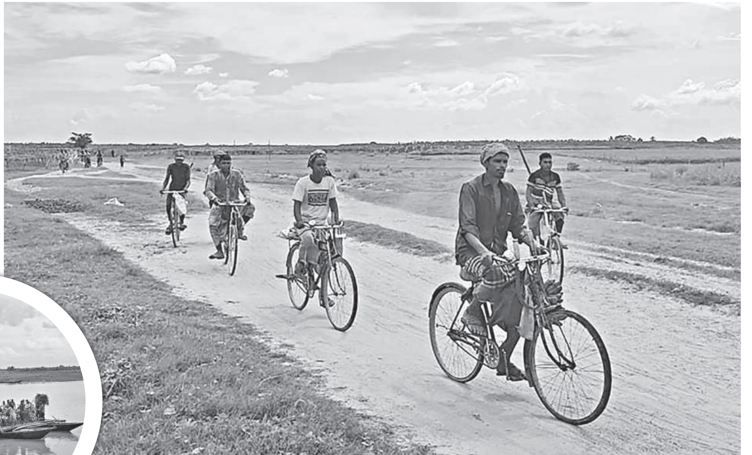
Farmers cycling to work at dawn while some carrying crops on vehicles or boats. In hindsight, these images paint a positive picture. However, beneath this lies a dark reality. Some local influential persons has subleased land in the Decree Char to only well-offs and prominent locals, depriving landless and poor farmers. The land meant for the destitute farmers can now only be accessed by wealthy individuals, as per allegations.

"I have taken a Banana cultivation project on 200 bighas of shoal land, taking sub-lease of 80 bighas from the lease-holder's