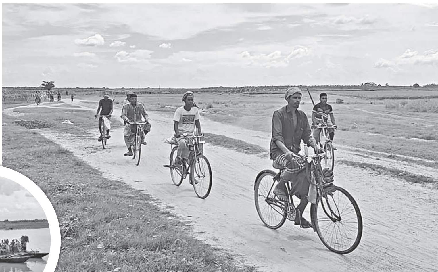
Farmers cycling to work at dawn while some carrying crops on vehicles or boats. In hindsight, these images paint a positive picture. However, beneath this lies a dark reality. Some local influential persons has subleased land in the Decree Char to only well-offs and prominent locals, depriving landless and poor farmers. The land meant for the destitute farmers can now only be accessed by wealthy individuals, as per allegations.