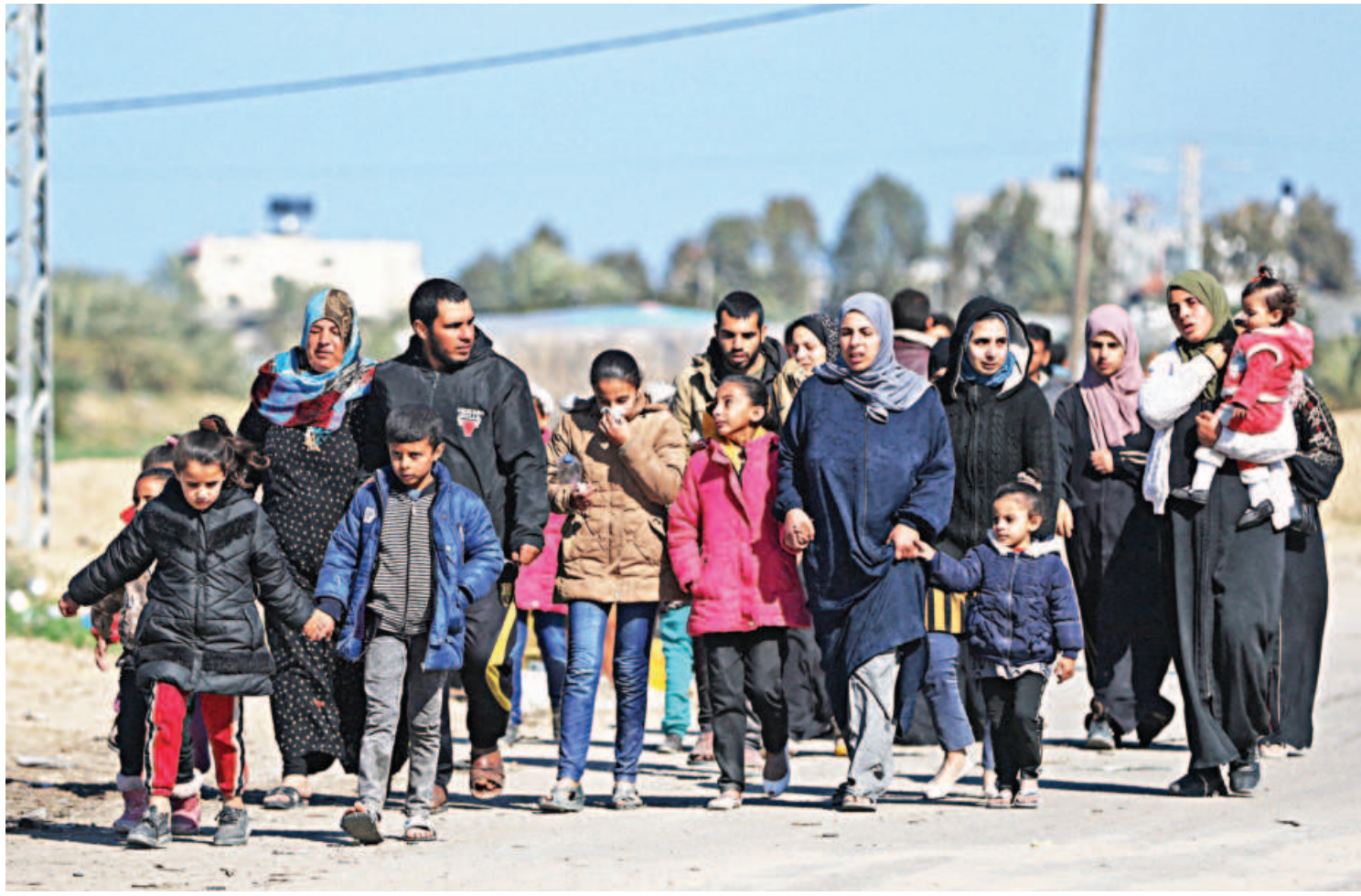
Palestinians fleeing Khan Younis, due to the Israeli ground operation, move towards Rafah in the southern Gaza Strip yesterday. Israel pressed its blistering assault on the Gaza city of Khan Younis, with the Hamas saying dozens were killed in heavy bombardment and urban combat.