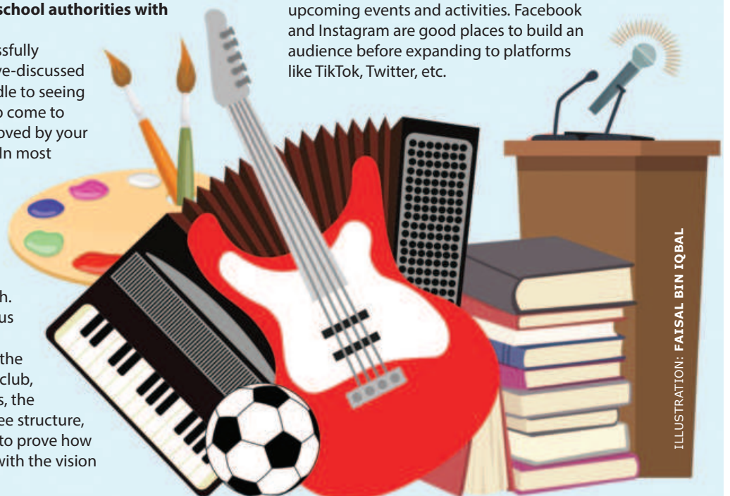
ILLUSTRATION: FAISAL BIN IQBAL

In this day and age, social media is perhaps the most powerful tool for promoting your club, attracting new members, and keeping everyone informed about upcoming events and activities. Facebook and Instagram are good places to build an audience before expanding to platforms like TikTok, Twitter, etc.