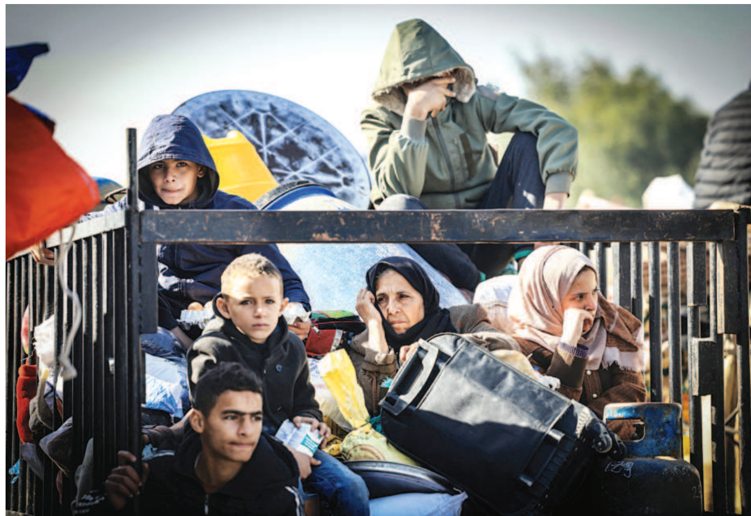
This photograph taken yesterday on the southern outskirts of Khan Yunis, in the southern Gaza Strip, shows Palestinian families fleeing the city on the coastal road leading to Rafah, amid Israeli ground operation in the Palestinian enclave.