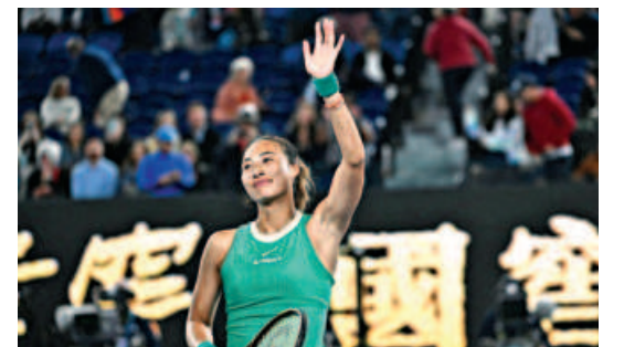
China's Zheng Qinwen outclassed France's Oceane Dodin 6-0, 6-3 under an hour in their women's singles match at Rod Laver Arena to move onto the quarterfinals of the Australian Open yesterday. Zheng will face Russia's Anna Kalinskaya in the last eight.

With batters throwing their wickets away and being unable to read the surface and adjust accordingly, so far, the blame for the dip in the quality of cricket needs to be taken by the cricketers more than the wickets and conditions.