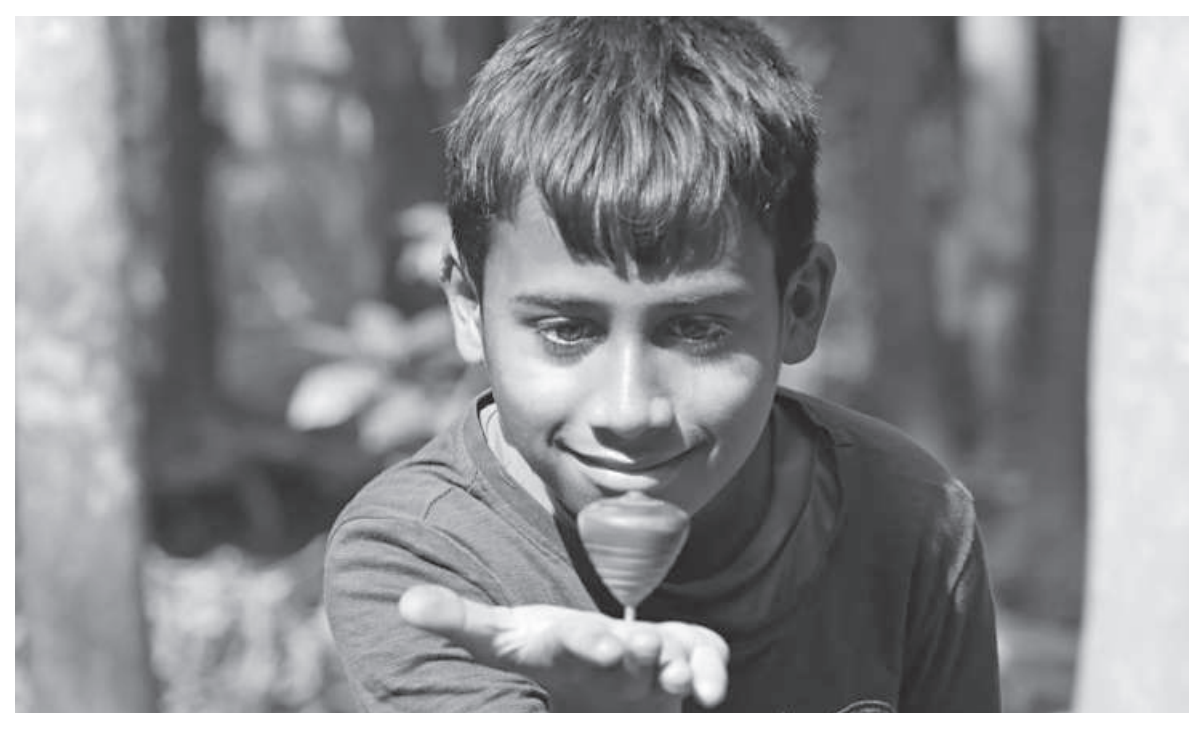
SPIN-FLING! Unleashing a top onto his palm, a boy enjoys its spin on a lazy winter morning in Bukhainagar of Barishal Sadar yesterday.

He led the Bangladesh delegation to the 19th Summit of the NAM and the third South Summit of the G-77 and China in Kampala, Uganda.