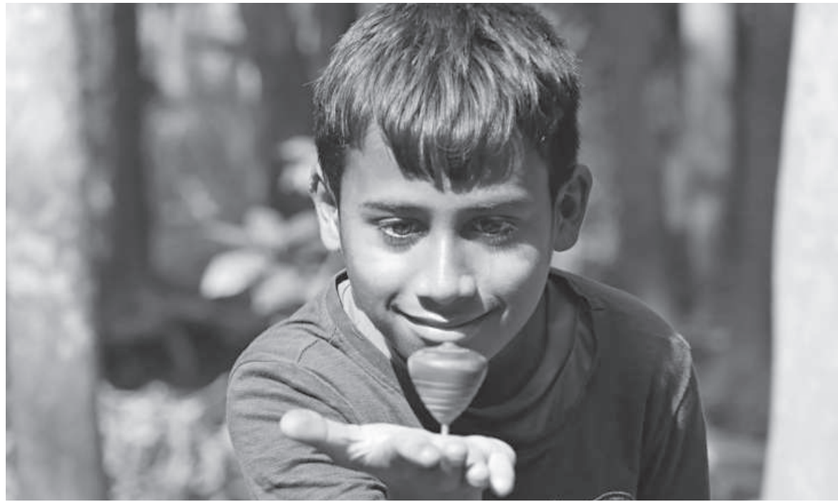
SPIN-FLING! Unleashing a top onto his palm, a boy enjoys its spin on a lazy winter morning in Bukhainagar of Barishal Sadar yesterday.