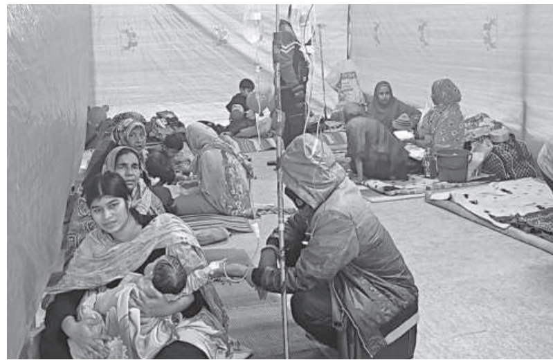
With the hospitals in Tangail struggling to cope with patients, many have no option but to receive treatment on the floor inside the wards or balconies. Meanwhile, most patients admitted to the district and upazila-level hospitals are children diagnosed with ailments including diarrhoea, pneumonia, and fever.

Around 700 patients were admitted in the diarrhoea ward of the hospital in the last two weeks, he said, adding that since some