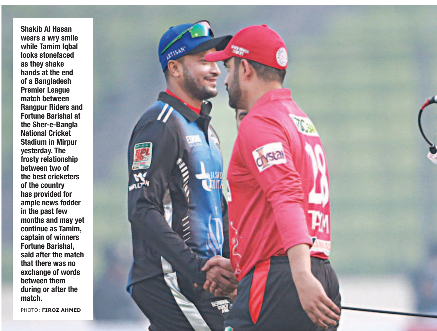
Shakib Al Hasan wears a wry smile while Tamim Iqbal looks stonefaced as they shake hands at the end of a Bangladesh Premier League match between Rangpur Riders and Fortune Barishal at the Sher-e-Bangla National Cricket Stadium in Mirpur yesterday. The frosty relationship between two of the best cricketers of the country has provided for ample news fodder in the past few months and may yet continue as Tamim, captain of winners Fortune Barishal, said after the match that there was no exchange of words between them during or after the match.