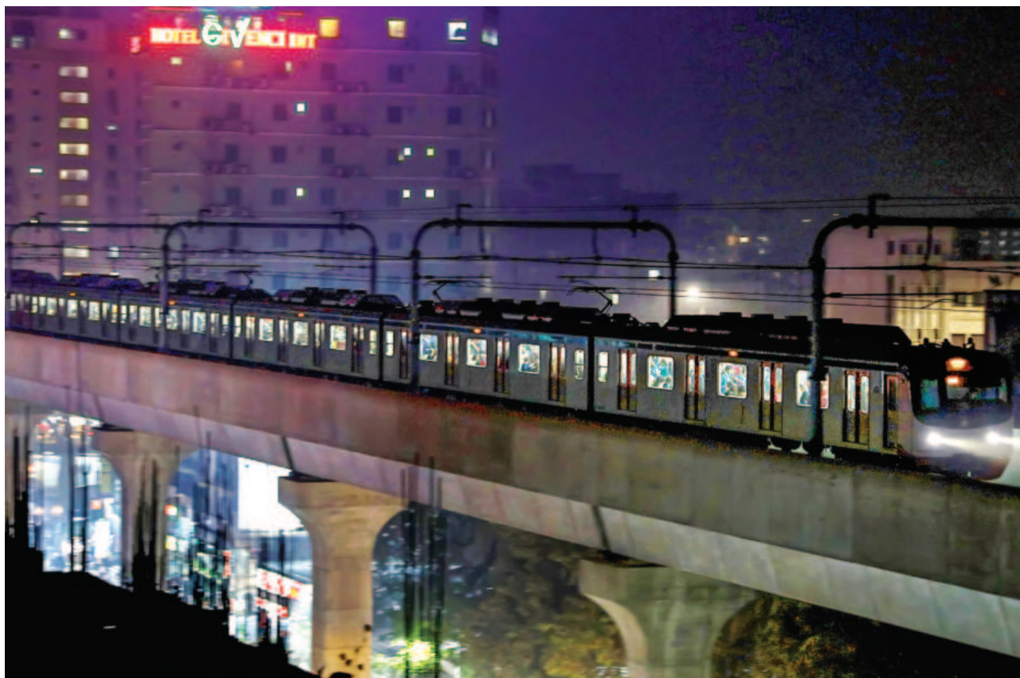
As the service hours of the metro rail's Agargaon-Motijheel section have been extended till 8:40pm from yesterday onwards, the number of commuters increased significantly with many jobholders using the metro to get home after work. The photo was taken from the Farmgate area around 8:00pm. Story on Page 3.

The information state minister made the announcement on X (formerly known as Twitter). On January 14, Arafat made the same remarks about formulating a framework to combat disinformation and rumours.