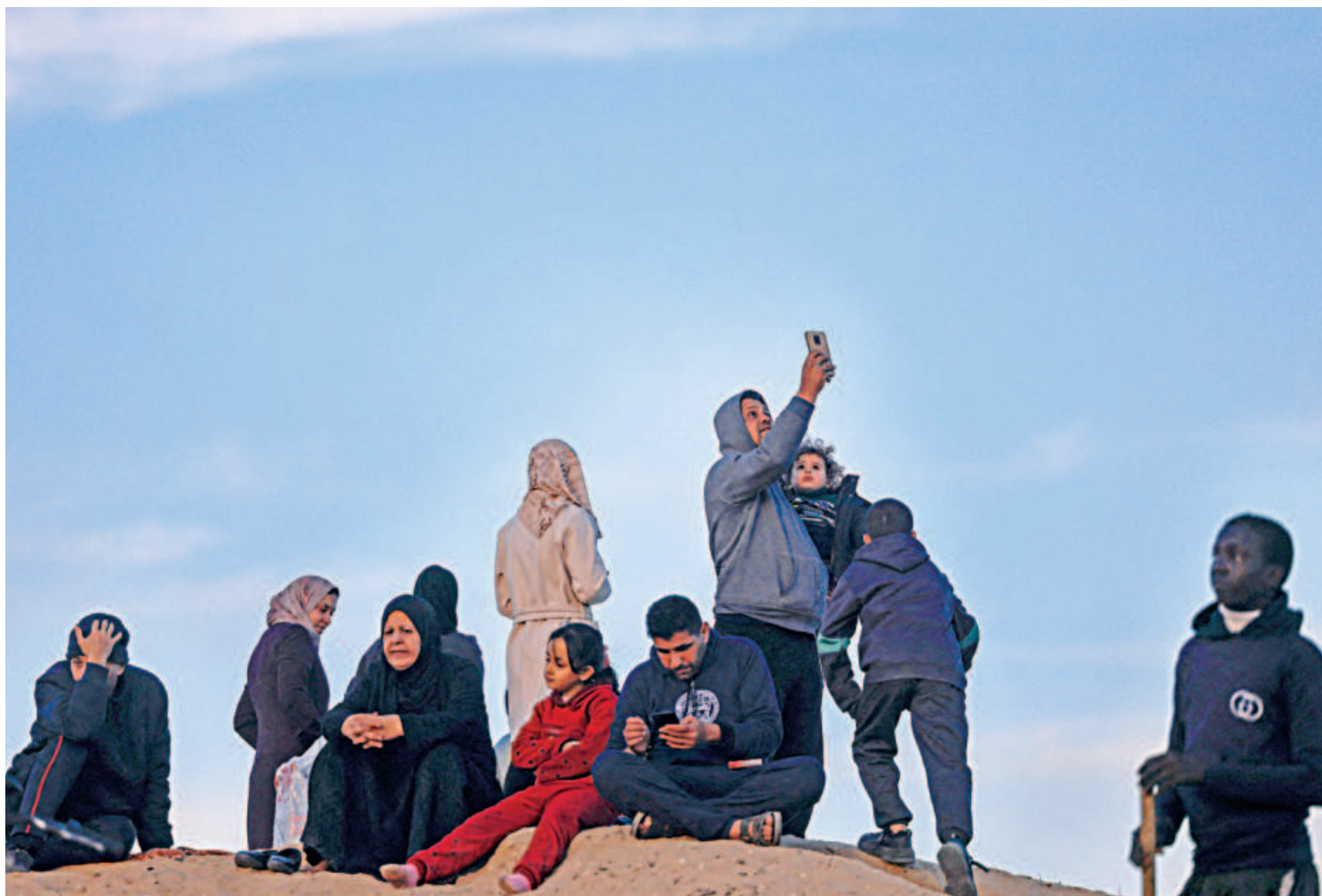
Displaced Palestinians using eSIM cards attempt to get a signal on Friday in order to contact their relatives on a hill in Rafah, on the southern Gaza Strip on the border with Egypt.

The injured survivor "is currently receiving treatment at the hospital and is in stable condition", according to the country's official news agency.