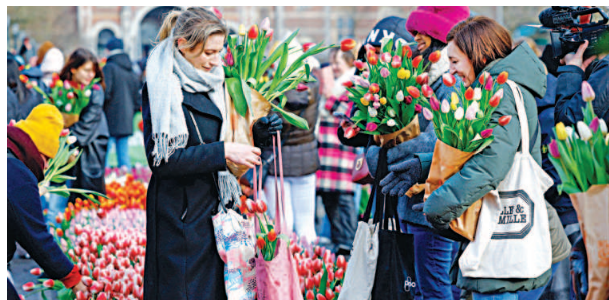
People hold bags with tulips in a picking garden with over 200,000 tulips that have been created on the Museumplein for National Tulip Day where everyone can pick one bunch for free, in Amsterdam, Netherlands yesterday.

Microsoft MSFT.O said on Friday that a Russian state-sponsored group hacked into its corporate systems on January 12 and stole some emails and documents from staff accounts. The Russian group was able to access "a very small percentage" of Microsoft corporate email accounts, including members of its senior leadership team and employees in its cybersecurity, legal, and other functions, the company said. Microsoft's threat research team routinely investigates nation-state hackers such as Russia's "Midnight Blizzard," who they say is responsible. The company said its probe into the breach indicated the hackers were initially targeting Microsoft to learn what the technology giant knew about their operations. The Russian Embassy in Washington and Ministry of Foreign Affairs did not immediately respond to a request for comment.