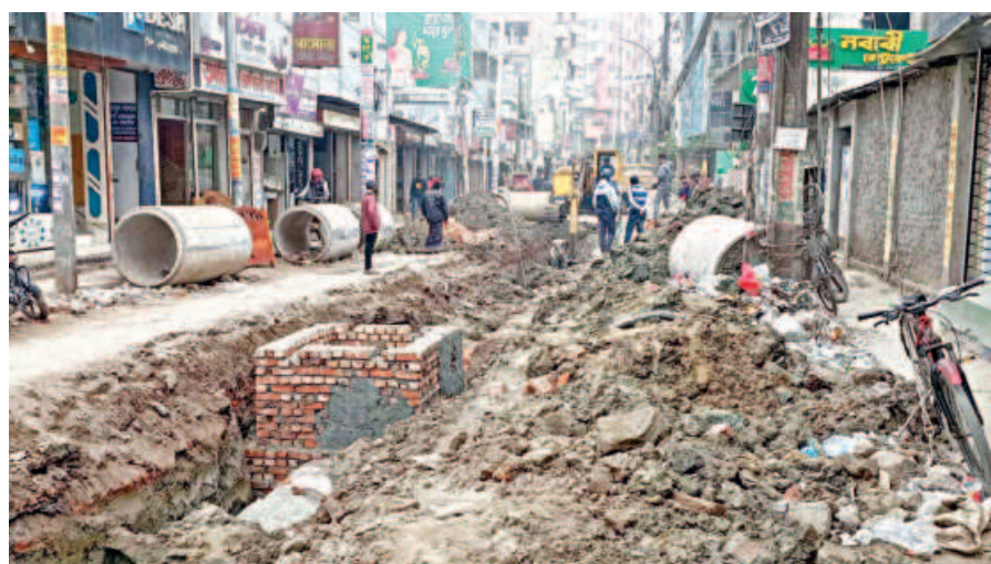
People struggle to cross the Saheb Ali Road as the street has been dug up for drainage development work, leaving it almost unusable.