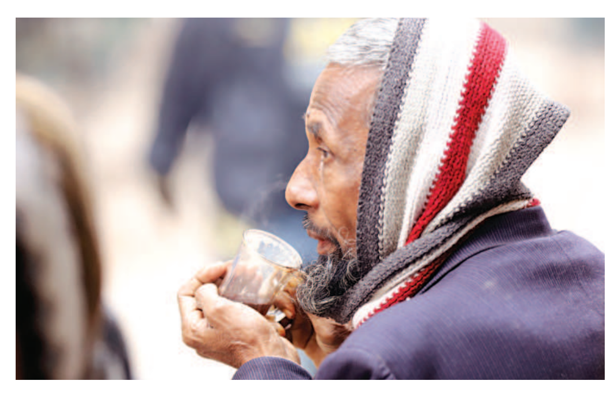
SIPPING INTO WARMTH. Holding a warm cup with his cold palms, a man drinks tea by the roadside in the capital's Mugda area. The photo was taken recently.