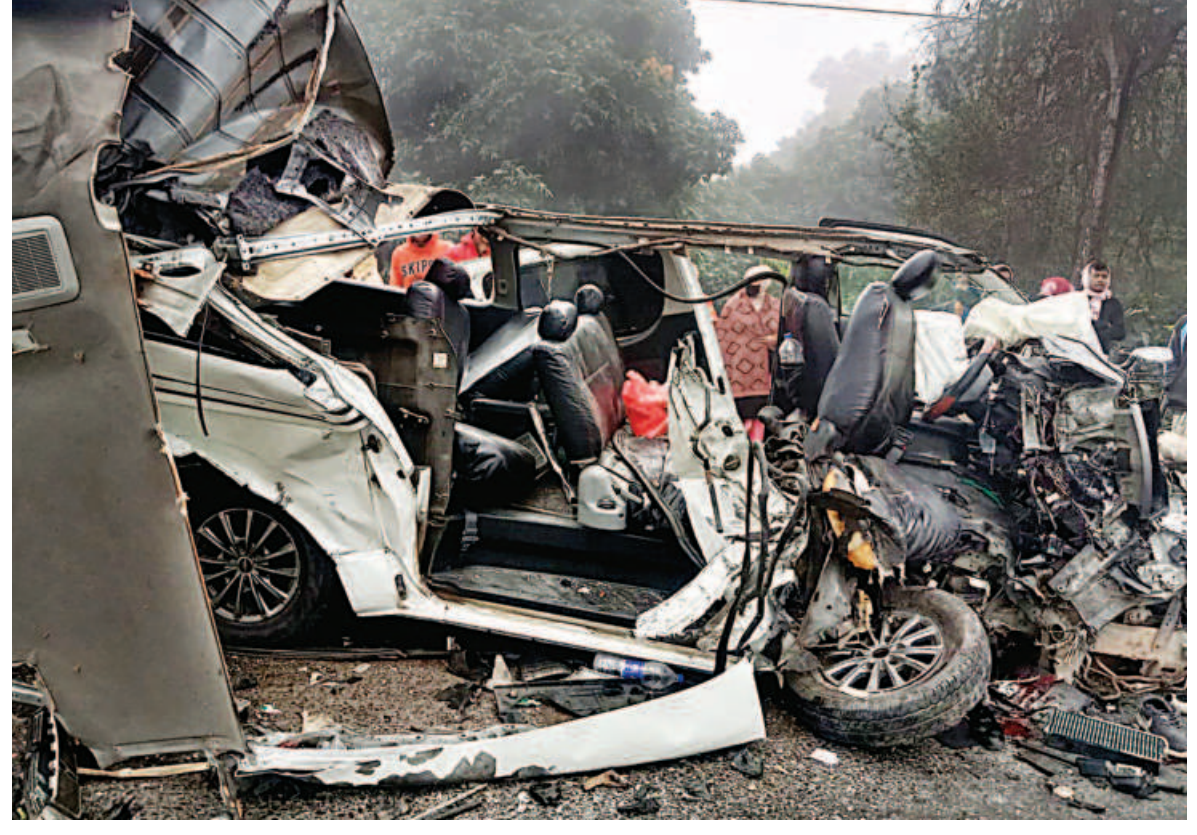
The wreckage of the microbus that was hit by a bus on Dashuria-Kushtia highway in Pabna yesterday.