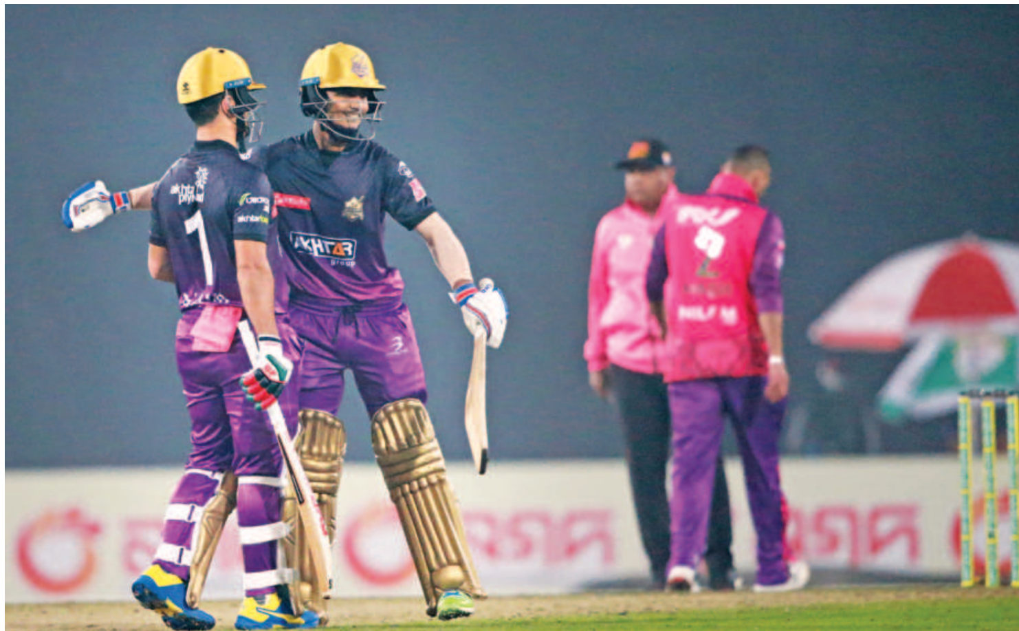
Chattogram Challengers' Najibullah Zadran is hugged by Shahadat Hossain as Sylhet Strikers skipper Mashrafe Bin Mortaza trudges back following the former's winning stroke in the second match on the opening day of the Bangladesh Premier League at the Sher-e-Bangla National Cricket Stadium in Mirpur yesterday.