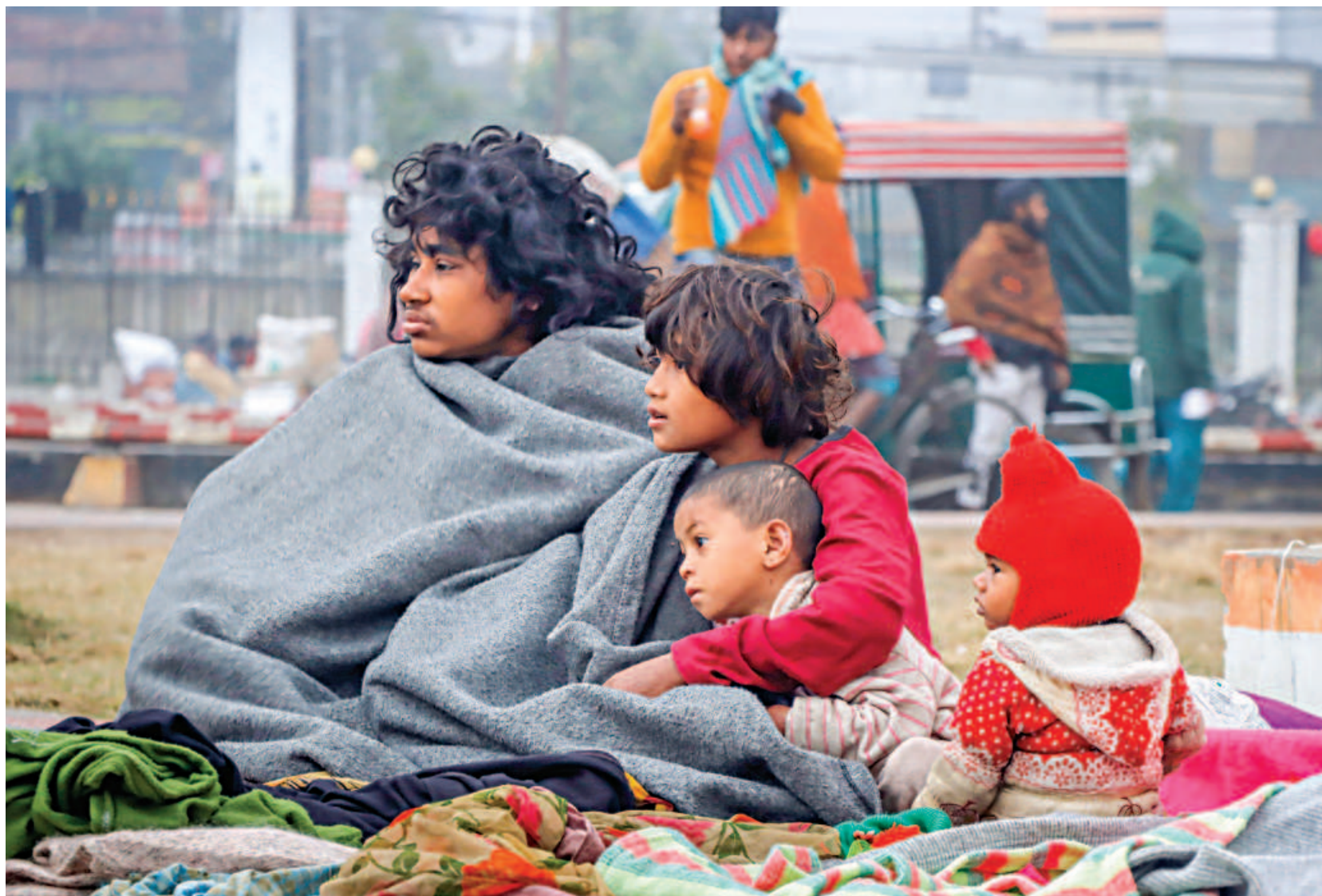
A group of homeless children sitting on a footpath near Khulna railway station. Underprivileged people, especially the children and elderly, are suffering the most amid the cold spell. The photo was taken yesterday.