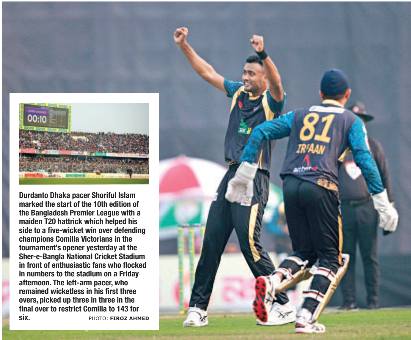
Durdanto Dhaka pacer Shoriful Islam marked the start of the 10th edition of the Bangladesh Premier League with a maiden T20 hatricket which helped his side to a five-wicket win over defending champions Comilla Victorians in the tournament's opener yesterday at the Sher-e-Bangla National Cricket Stadium in front of enthusiastic fans who flocked in numbers to the stadium on a Friday afternoon. The left-arm pacer, who remained wicketless in his first three overs, picked up three in three in the final over to restrict Comilla to 143 for six.

Mehedi Hasan Miraz talked to the media after Barishal's training yesterday, saying: "He has been communicating with everyone and boosting the players. Understanding is very important and our senior cricketers played under him before. Coach's communication is very important."