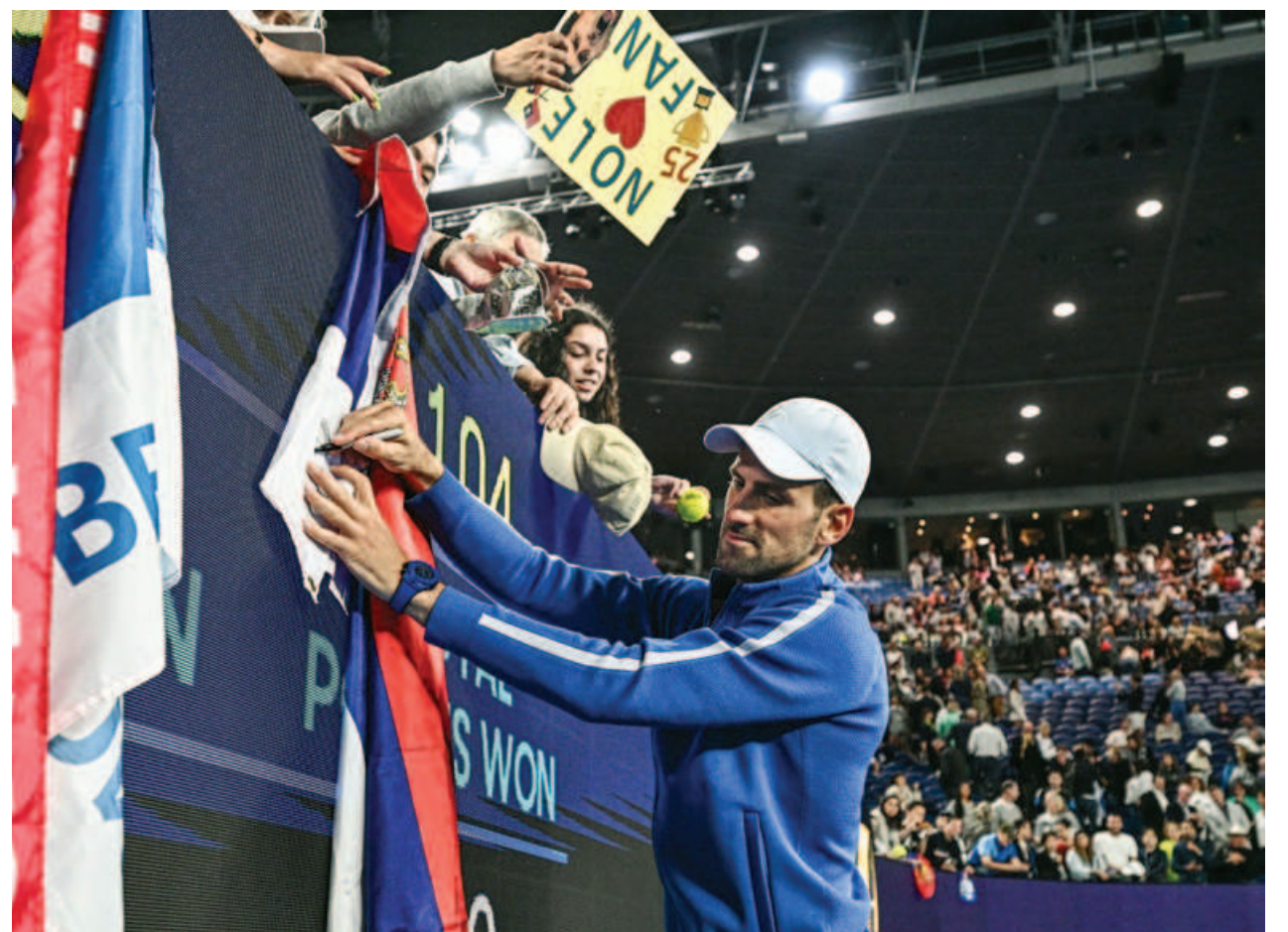
Serbia's Novak Djokovic signs autographs for fans following his 6-3, 6-3, 7-6 victory against Argentina's Tomas Etcheverry in the third round of the Australian Open in Melbourne on Friday. The 10-time champion, who was dragged into dogfights in the first two rounds, gave a masterclass in clean and clinical tennis for two sets as he picked apart the 24-year-old Argentine in his 100th match at Melbourne Park.

The tournament, which was originally supposed to be held in Sri Lanka but got shifted to South Africa after the island nation received a ban from the ICC, began yesterday with Ireland defeating the USA by seven wickets and South Africa beating the West Indies by 31 runs.