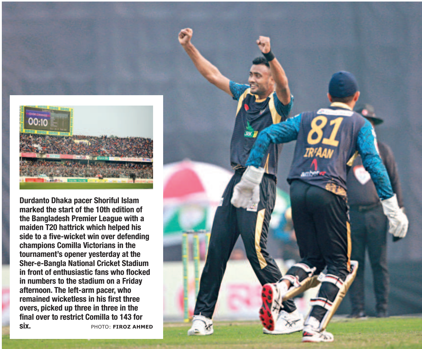
Durdanto Dhaka pacer Shoriful Islam marked the start of the 10th edition of the Bangladesh Premier League with a maiden T20 hat-trick which helped his side to a five-wicket win over defending champions Comilla Victorians in the tournament's opener yesterday at the Sher-e-Bangla National Cricket Stadium in front of enthusiastic fans who flocked in numbers to the stadium on a Friday afternoon. The left-arm pacer, who remained wicketless in his first three overs, picked up three in three in the final over to restrict Comilla to 143 for six.

Mehedi Hasan Miraz talked to the media after Barishal's training yesterday, saying: "He has been communicating with everyone and boosting the players. Understanding is very important and our senior cricketers played under him before. Coach's communication is very important."